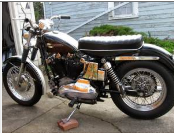
1972 XLCH 1000 23)