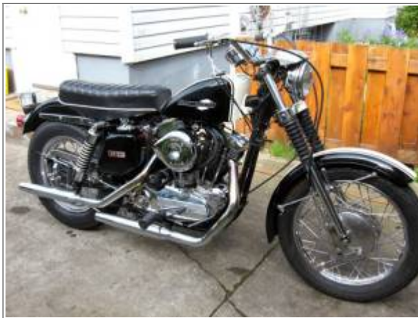
1972 XLCH 1000 22)