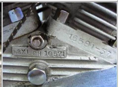
1968 XLCH Engine VIN 40)