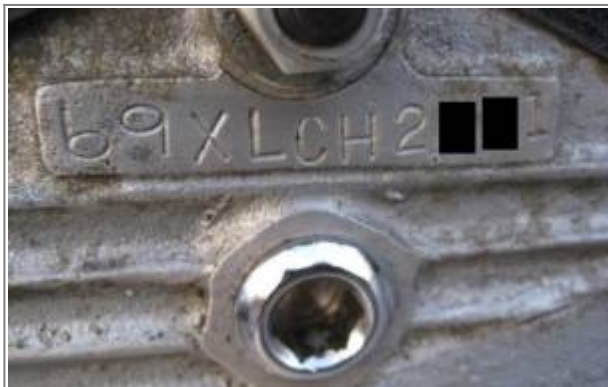
1969 xlch vin 41)