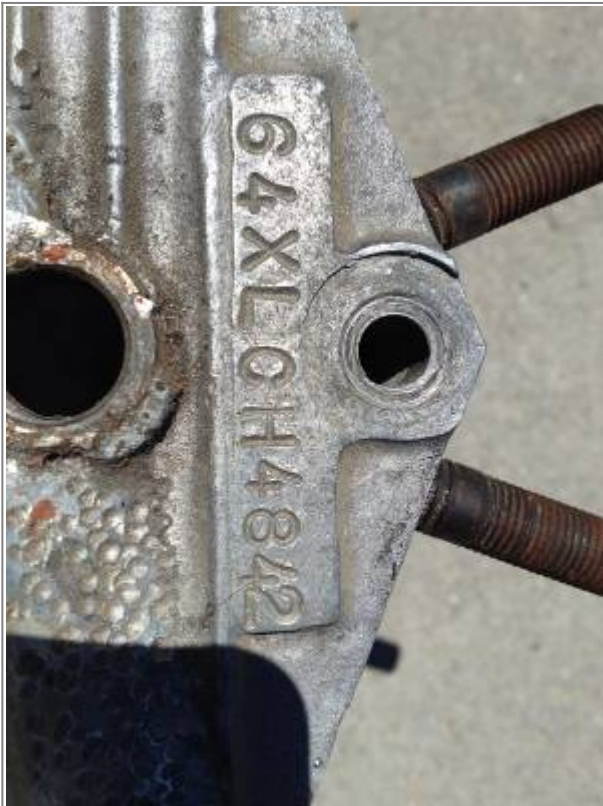
1964 XLCH Engine VIN 38)