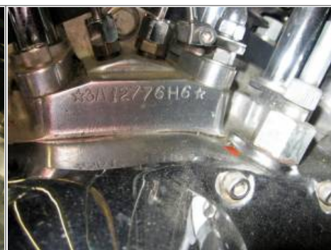
1976 Factory Engine Identification Numbers 43)