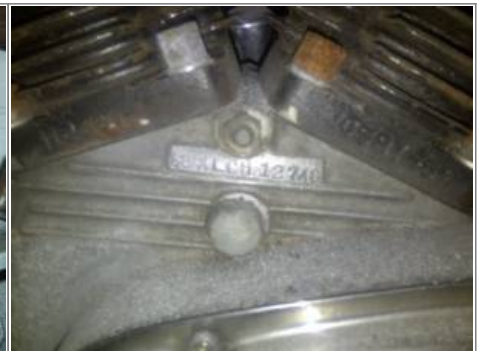
1968 XLCH Engine VIN 39)