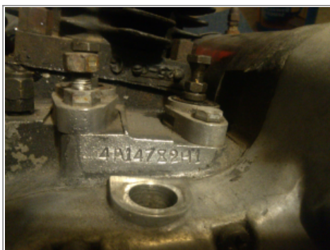
Early 1971 Factory Engine Identification Numbers 42)