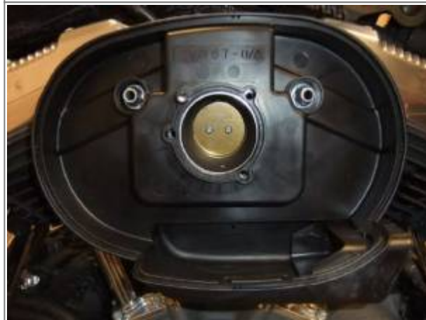
Backing plate (29367-07A) 7)

With the stock configuration, the mist is vented back into the intake.