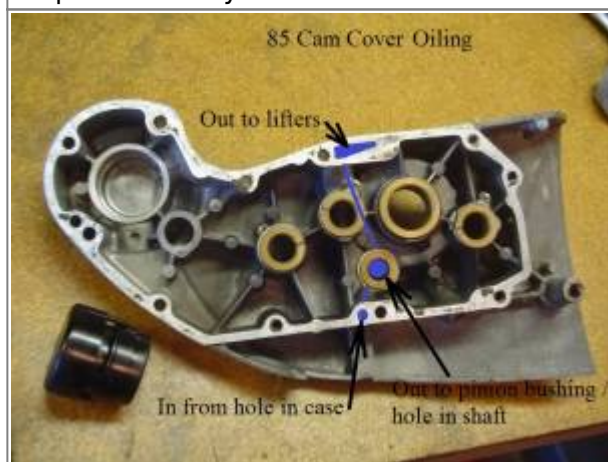
Oil path of 85 style cam cover 3)

It's narrow enough that it doesn't block debris from getting out of the hole.