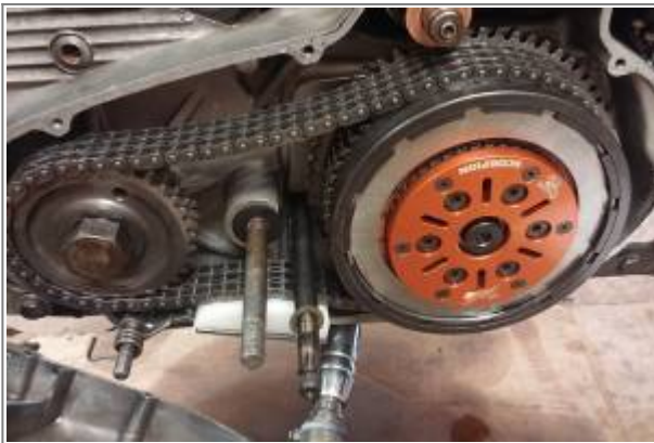
77 XLH with 86-90 Primary Chain Tensioner & Spring (40019-86) 1)