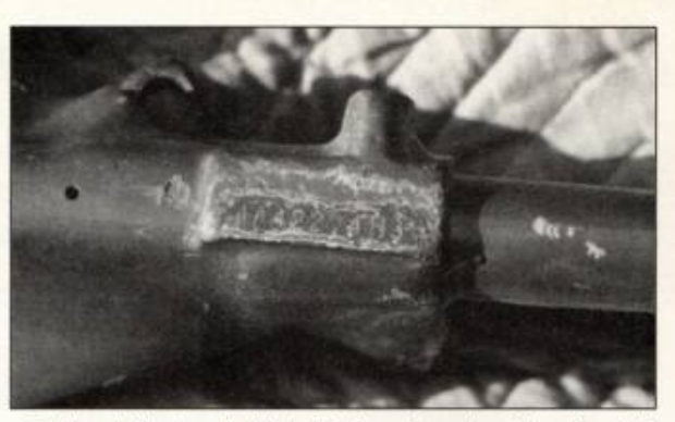
Bere is the frame's VIN on the frame boss located on the right side of the neck, just above the downtube. These characters have the same style and coding system as the engine VIN.

As I said, these case numbers are a good way to tell if the engine numbers have been changed. Here's how: if the case number says it's the same (or earlier) year as the engine's VIN, it's so-