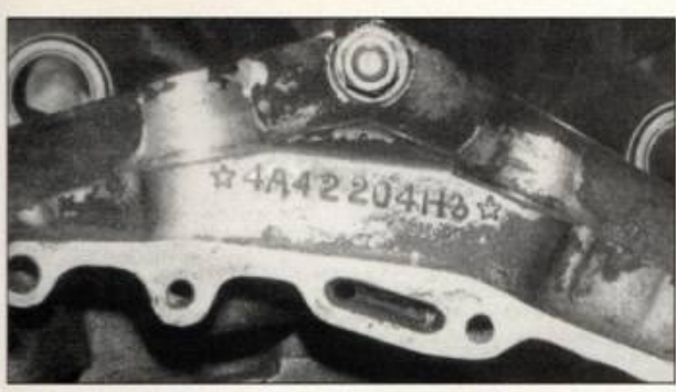
2 Here are the new style numbers which were used on 1970 to 1980 Ironheads. These also have a coding system. This number identifies the bike as a 1973 kick start 1000cc XLCH Sportster.

you somehow discretely find out how your particular state handles this. Some states don't care what's on the engine because it registers bikes by frame number; others do the engine only. Many do both. When the frame and engine don't match, it doesn't mean some parts are hot (though that may be the reason), but it may mean you'll have problems trying to get it registered. If the frame or engine VIN does come back as hot, most states take the whole bike and everything else in the garage. Check this out thoroughly before you buy the bike.