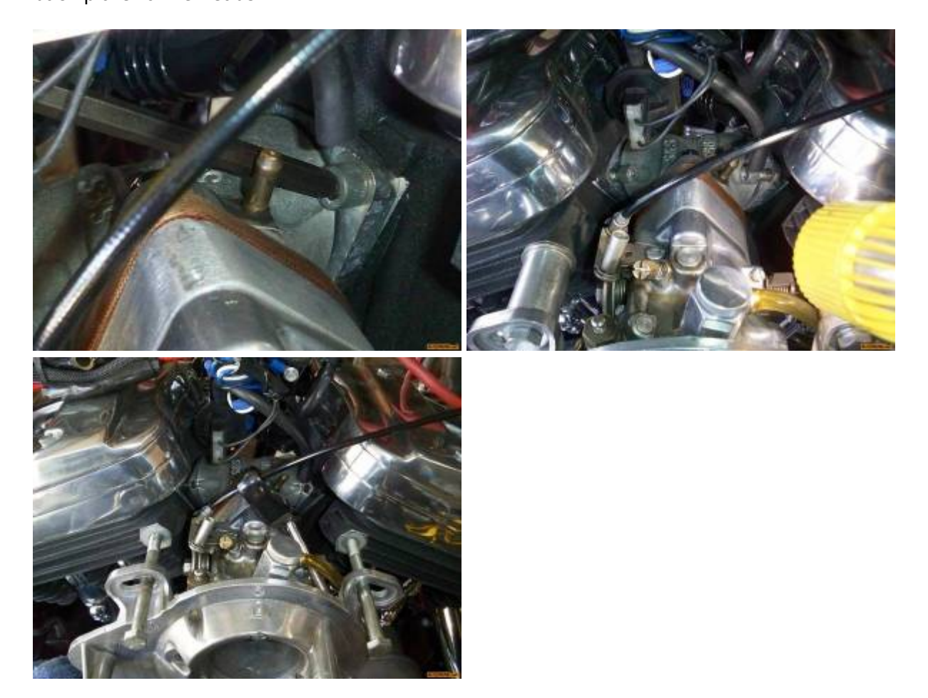
Now you should be able to remove the entire intake manifold, carb, back plate assembly. The throttle cable was left on below since the carb will not be serviced here but just the manifold seals. Applying some grease to the seals prior to installation will help keep down air leaks later. <sup>4)</sup>