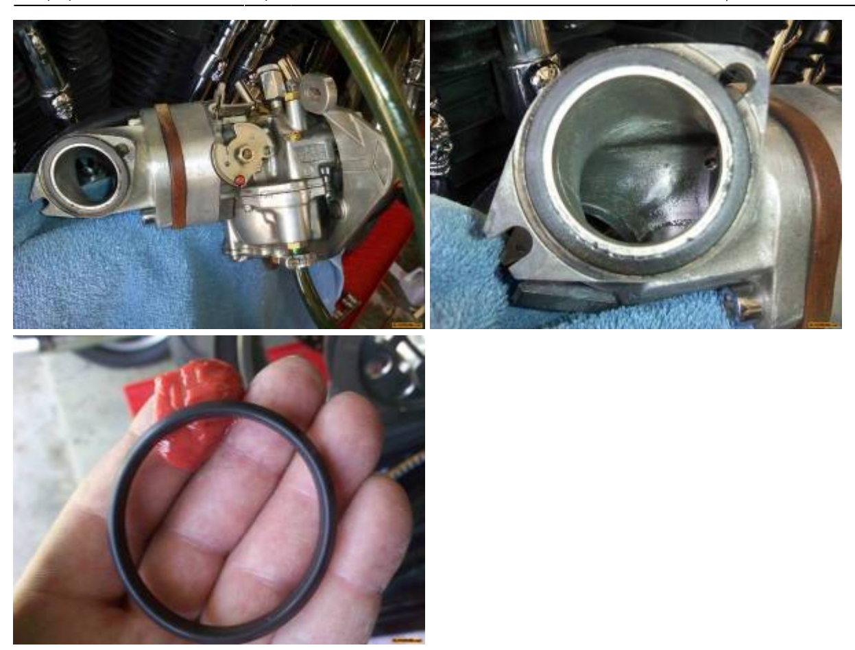
Install the seals. Don't forget to clean where the seal fits to the head. 5)