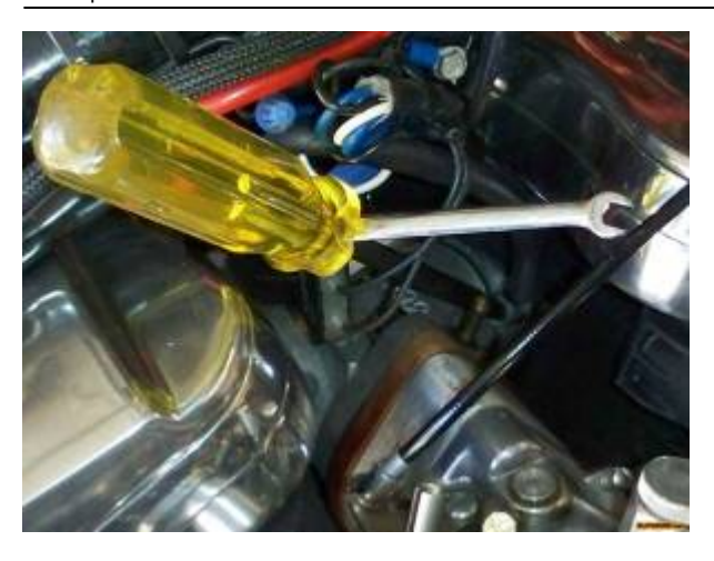
With all 4 of the intake manifold bolts are removed, then remove the 2 bolts that hold the air cleaner back plate to the heads. <sup>3)</sup>