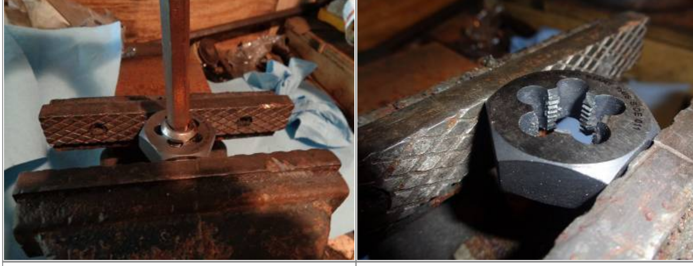
Before chasing the threads

Run the plug down the die with the wrench and insure the head sits flat against the die. Then all you have to do is clean the debris with brake cleaner or WD-40