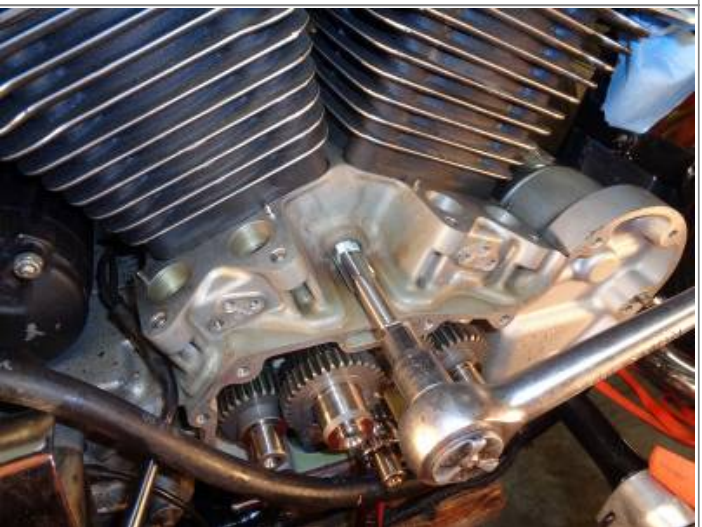
Flutes catch and keep the bulk of the shavings

The panty hose keeps small particles out of the engine case. The shavings on the panty hose pictured got there from the tap