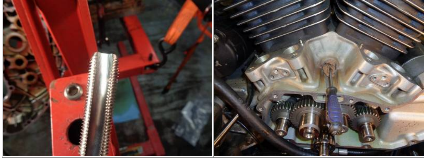
Check for debris and when satisfied, your done with the case threads