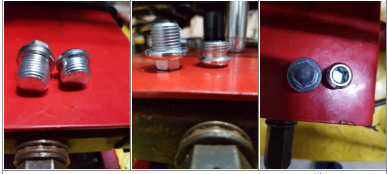
Measure the heads on the old and new plug, grind the new one if needed. ^{31)}

The head may be larger than the original but it can be ground to fit with a bench grinder. ^{ m 30)}