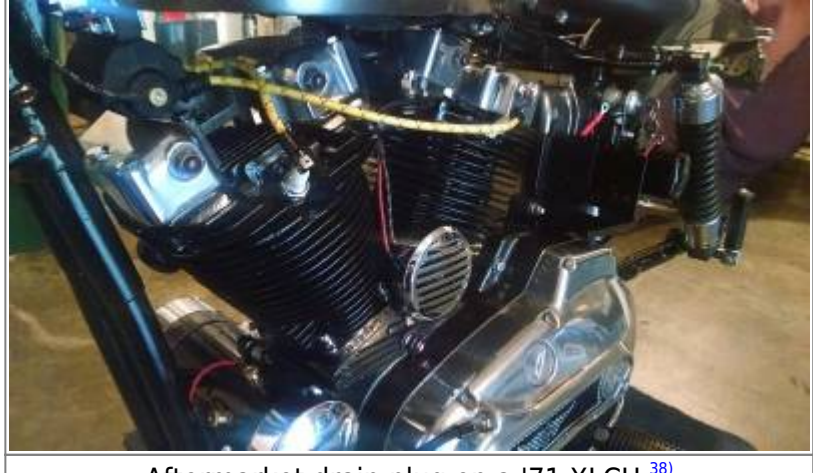
Aftermarket drain plug on a '71 XLCH <sup>38)</sup>