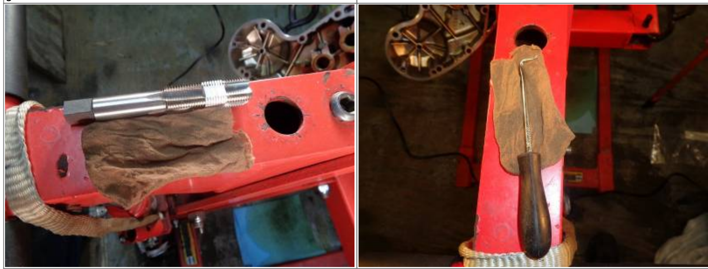
Pack the panty hose beyond the intended repair area

The pick is to guide and maneuver the panty hose