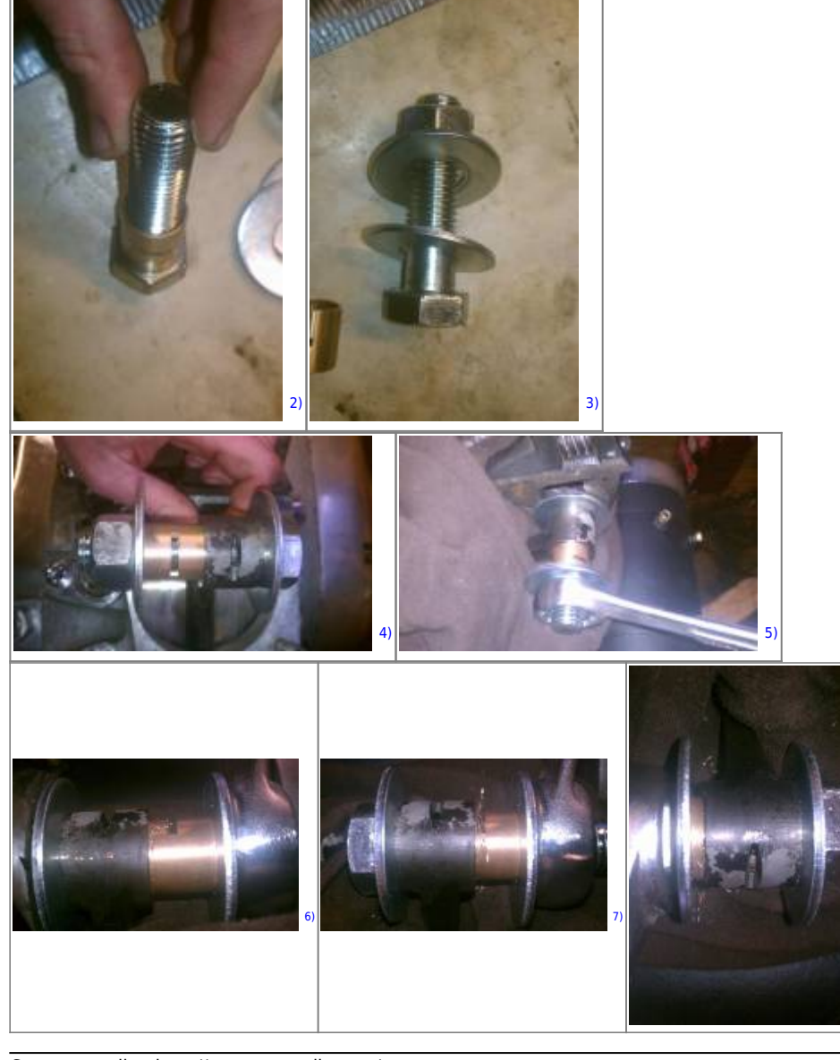
Sportsterpedia - http://sportsterpedia.com/

• These were done using a 3/4" bolt with two washers and a nut. <sup>1)</sup>