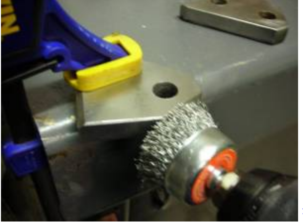
The final shaping was done, edges smoothed with a wire brush, test fitted and painted.