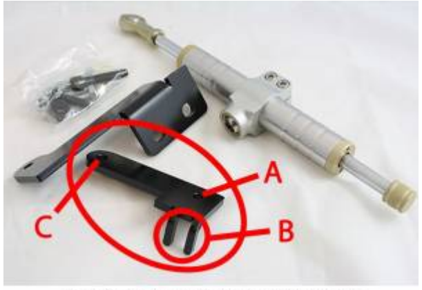
Dynamic Bike Innovations steering dampener