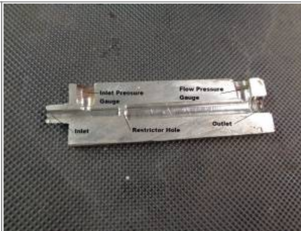
Cut-away showing the air path 16)