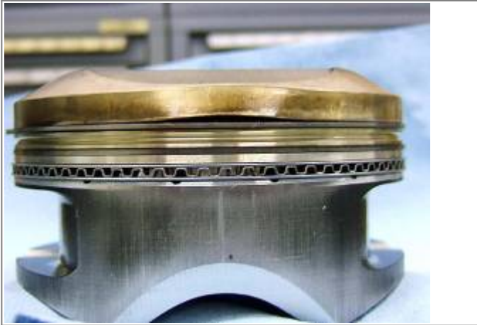
This piston is just about to break from too much cylinder pressure. This is from a race motor using Nitromethane 42)