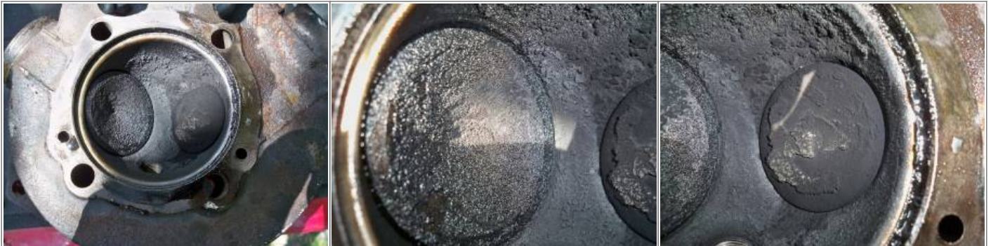
Excess carbon between valve and seat causing a leak on this 73 XLCH. 37)