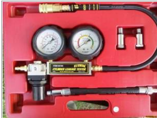
HF Leak-Down Gauge 15)

However, all are definitely not the same.