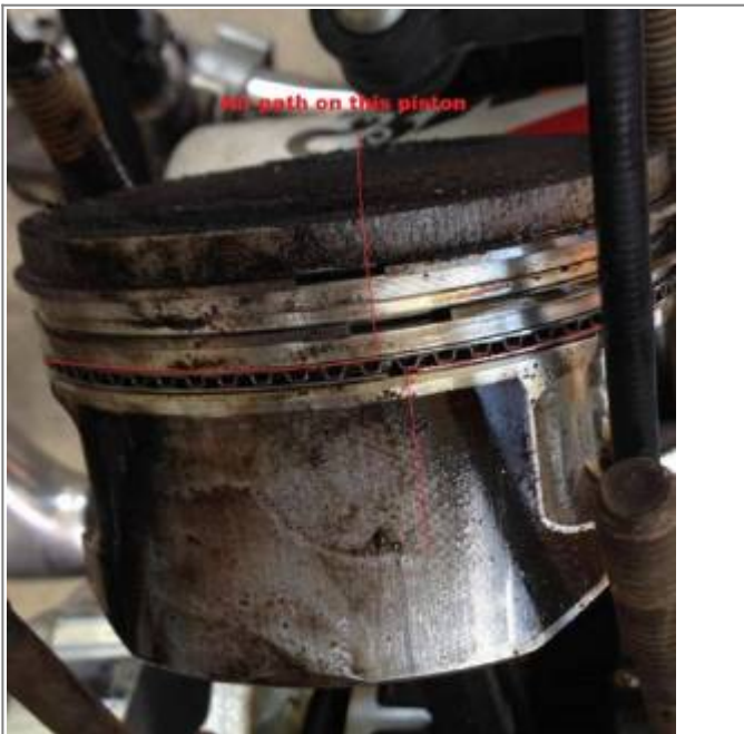
Top 2 rings are lined up vertically on this piston 41)