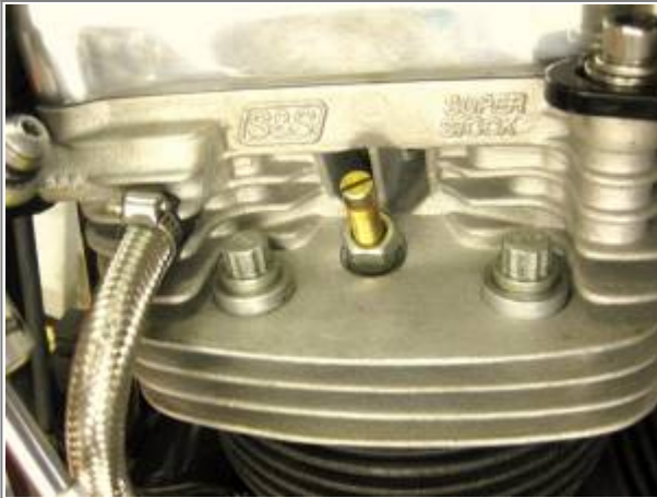
Commercial Piston Stop Installed 6)