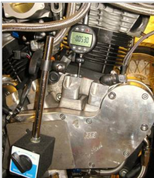
Dial caliper mounted over lifter bore 5)

When you are confident that the cam lobe is at it's lowest point, re-set the dial face to 'zero'.