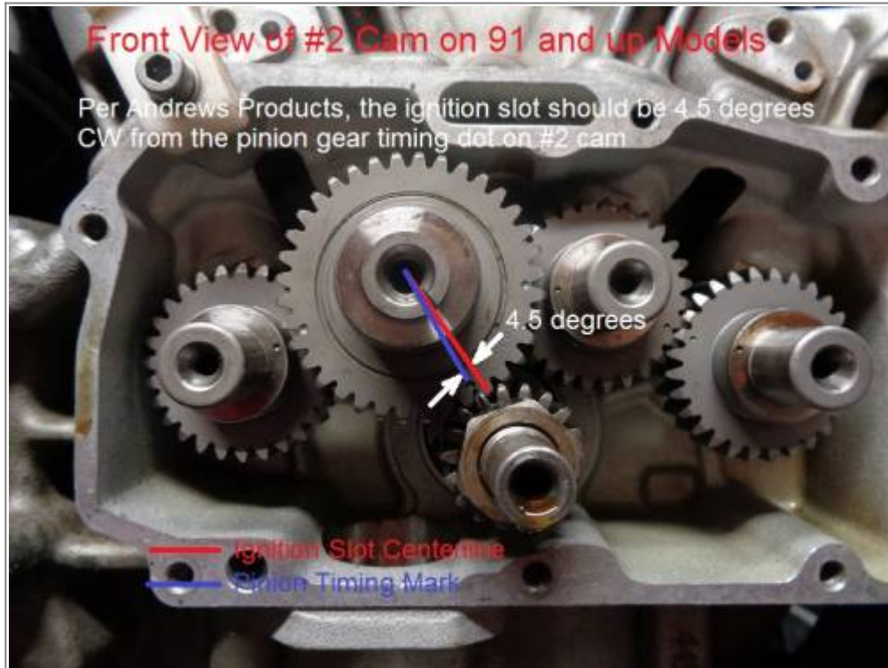
#2 Cam, Outside Gear Location (91 and Up Models) 22)

One visual on 91 and up Andrews cam gears is to look at the keyway for the timing cup. The timing mark for the pinion gear should be between two gear teeth on the cam. The pinion gear tooth with the timing mark should mate between the two adjacent teeth on the cam. (on either side of the cam gear mark) For #2 cams with the timing cup notch; The centerline of the notch points to the right adjacent tooth from the pinion timing mark. (the centerline of the timing notch is 4.5° clockwise from the center timing mark on the #2 cam. 21) as in the pic below):