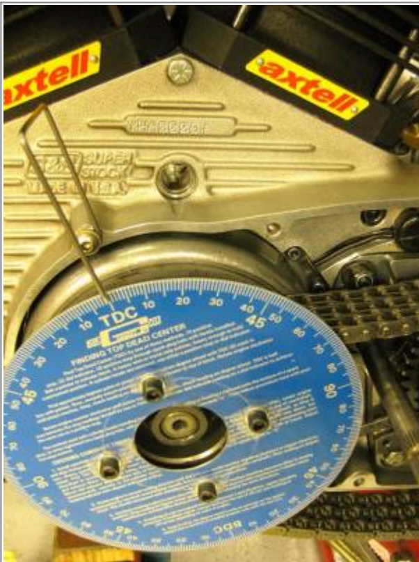
Degree wheel mounted on primary side 7)