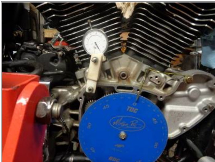
2. With rotated cam lobe height at .053", Degree wheel shows: 30° before TDC (BTDC) on exhaust stroke 13)