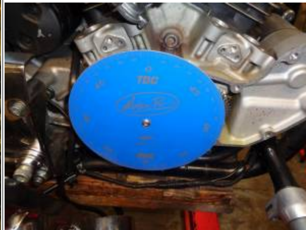
Degree wheel mounted to the pinion shaft 8)