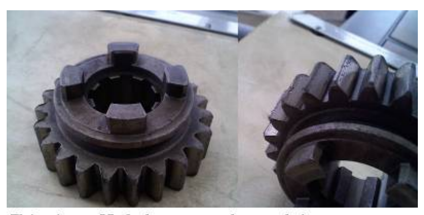
This is a CS 3rd gear, only used 1 season. The dogs look almost new, but look at the teeth. That deformation is from putting more power thru the teeth than they can handle. Actually, crushing the parent steel under the hard case.

2024/05/03 06:40 5/10 REF: Service Procedures 9