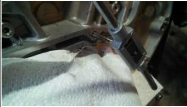
Chasing cam cover threads. 12)