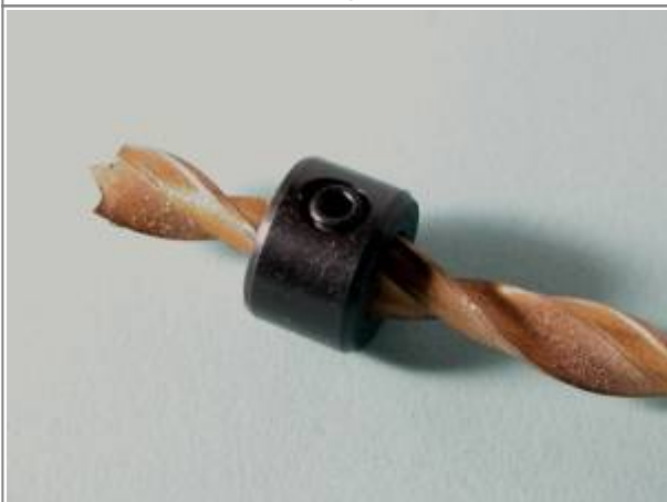
Drill Bit Stop Collar 16)

You can also remove the set screw and use the collar as a drill guide.