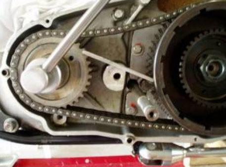
Two more little pieces to jam between the inner and outer clutch drums, with the main sprag still in place. You have to be careful to keep them all in position when tightening. <sup>6)</sup>