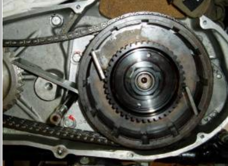
Clutch Sprocket Locking Tools 7)