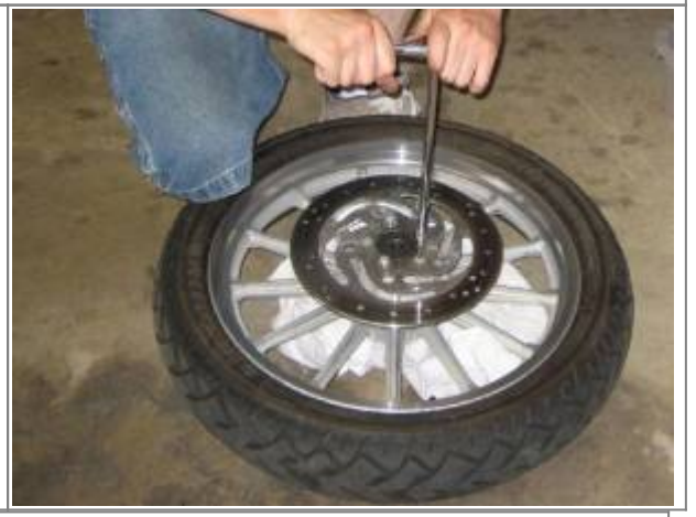
A good sturdy corner of a wall helps to stabilize the wheel while you bang on it. ^{11)}