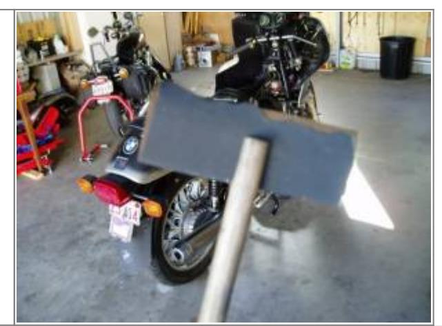
Roll it around so it matches the direction of rotation

of your electric drill so it goes with the flow, not against it. 7)