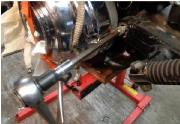
93-03 (2925A) pivot bolt screw (3/8" Allen head)

Then use a screwdriver to pry the bolt out while turning the screw. Continue turning while giving up pressure on the wrench to back the bolt out.