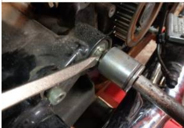
93-03 (41568-81B) swingarm pivot bolt (1" head head)