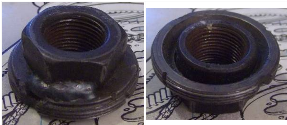
Swingarm thread repair tool 6)

A wrecked right side bearing locknut 47515-52 [52 to E74] with a fitting welded into it. Slots were cut into the threads and it is used to chase / repair the threads in the swingarm. 5)