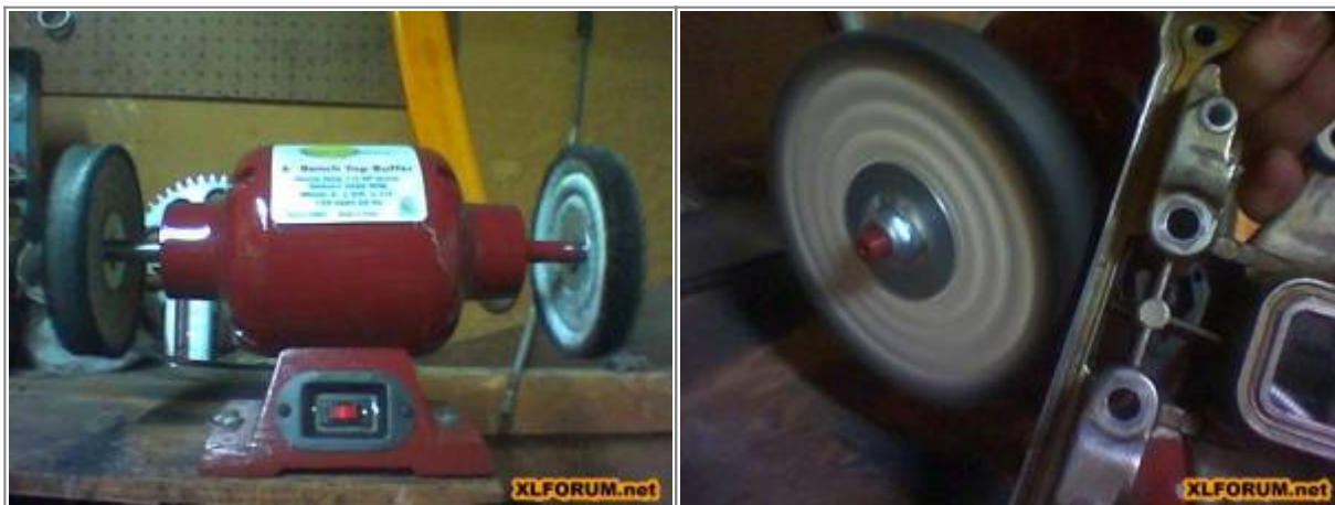
Polishing a rocker box top with a benchtop buffer 2) 3)

You can tell when you need to apply more from how clean the polish surface starts becoming. 1)