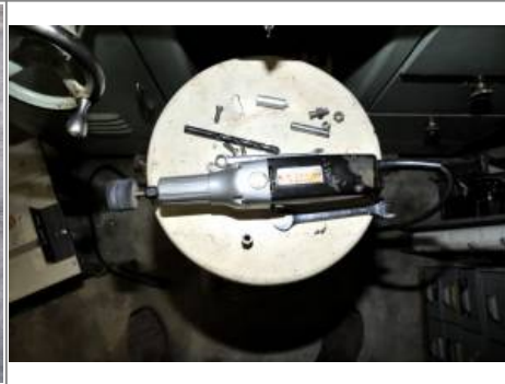
High speed grinder and hard felt wheel 10)