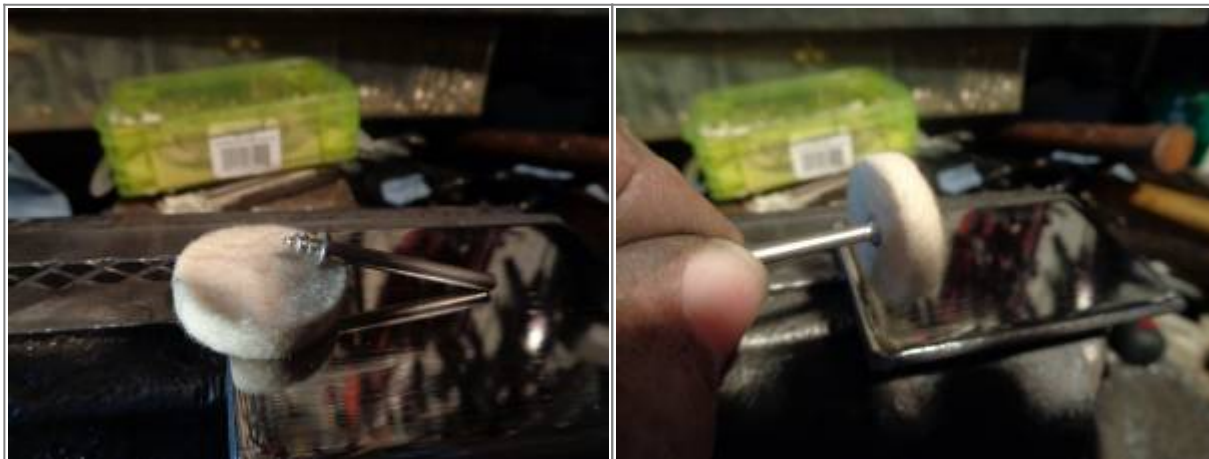
Dremil polishing pad mounted to a threaded shaft 16)

To help keep the pad from spinning off the shaft, you can mount it to a metal cutting wheel mandrel. Add a small washer over the attaching screw and snug it down against the pad. It doesn't have to be real tight.