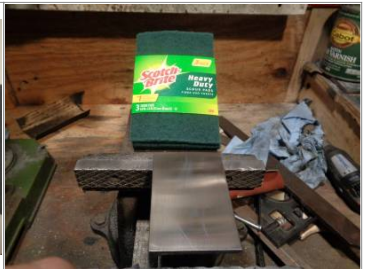
Heavy duty Scotch-Brite 26)

Here is a general chart with different Scotchbrite grades: