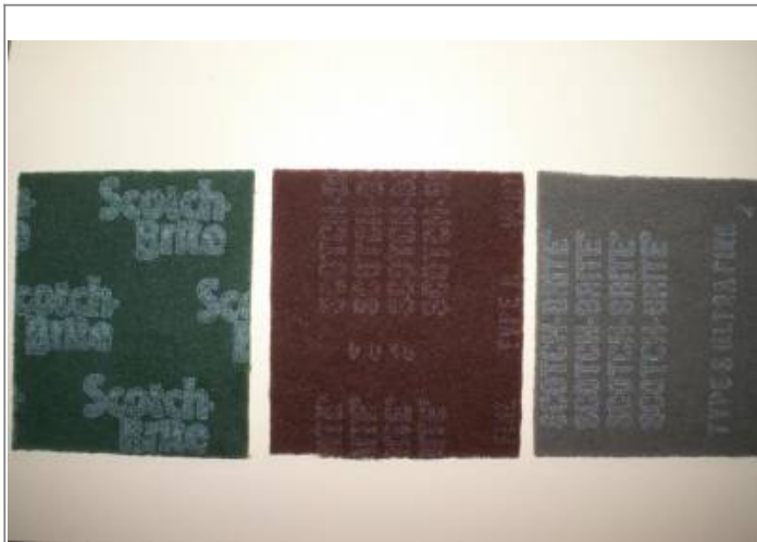
Scotch-Brite Grades 25)