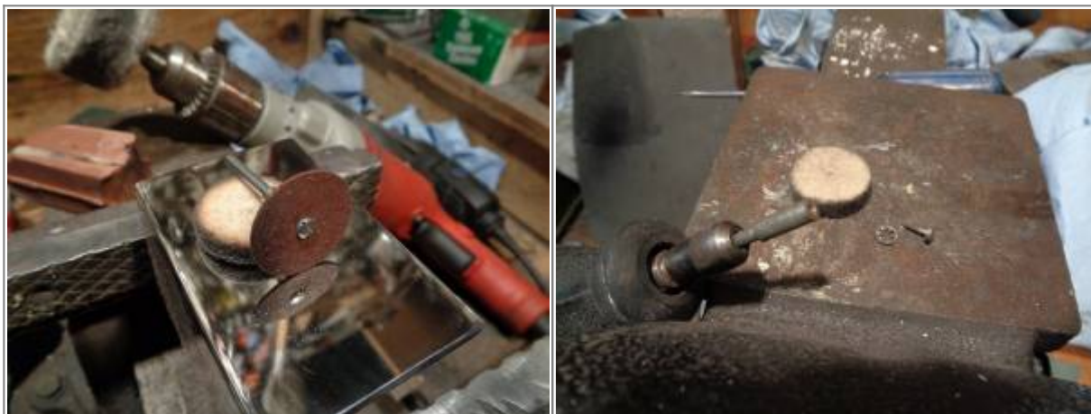
Dremil pad mounted to a cutting wheel mandrel 17)

To help keep the pad from spinning off the shaft, you can mount it to a metal cutting wheel mandrel. Add a small washer over the attaching screw and snug it down against the pad. It doesn't have to be real tight.