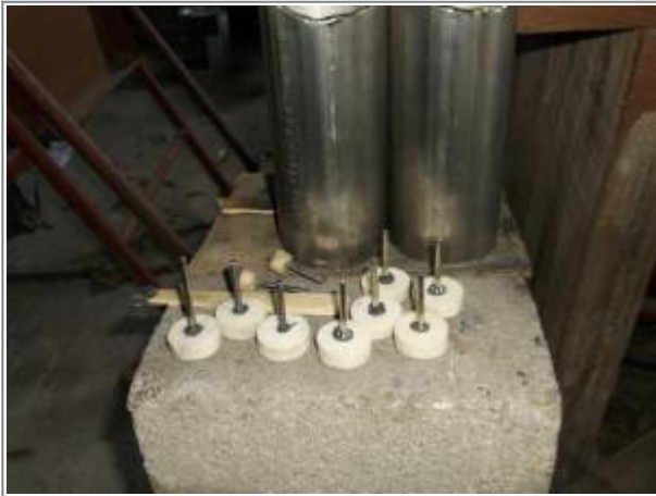
Polishing wheels for Dremil type tools 22)

Below are some wool polishing pads that were glued to mandrels. The larger ones are the 7/8" pads. They will last a very long time mounted with epoxy. But you need to let them cure over night before use for best results. The two smaller ones laying down behind them are 3/8" pads. They are good for getting in tight places. 21)