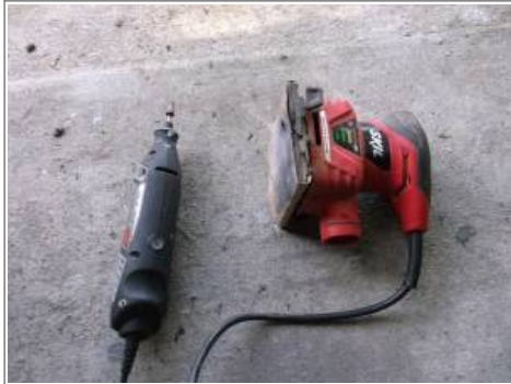
Dremil rotary tool and palm sander 9)

The 1" buffing bits will fit most places and the small 3/8" felt bullet shapes fit into most screw recesses. 8)