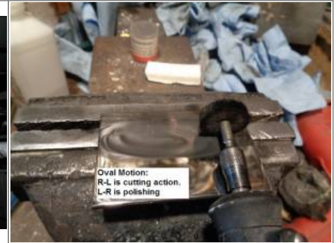
Dremil tool cut and polish action 11)