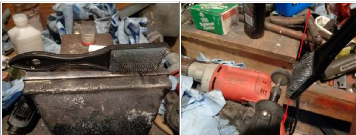
Wheel rake 23)

Loading too much polish on the wheel smudges and doesn't help you cut the metal. Pressing too hard while working also gathers and compresses polish into the wheel. Use this to unload excess polish and fine metal particles from the wheel and recondition the edge.