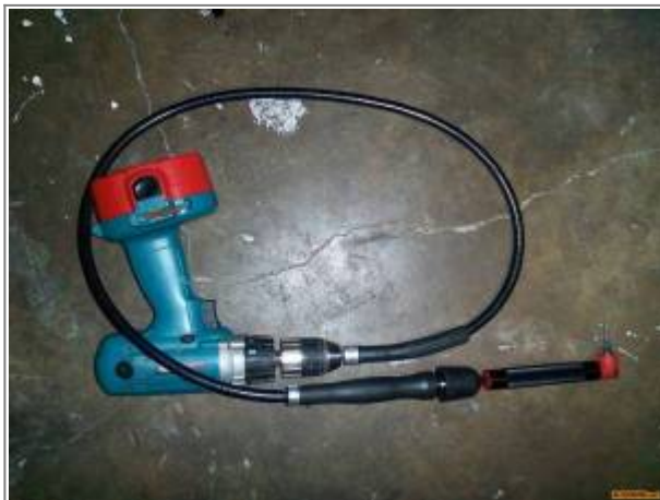
Flexible drill attachment 14)

A felt buffing pad works well (better than a thumb and wider than a dremel, so no little swirls). 13)