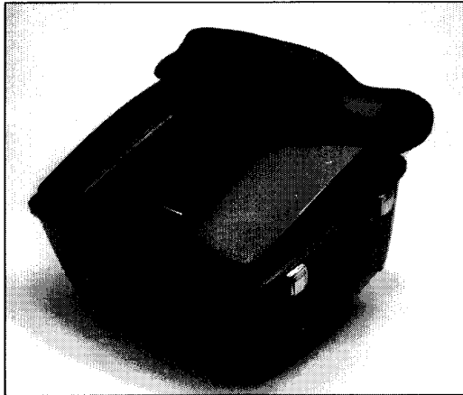
FLHR Tour-Pak and Passenger Backrest