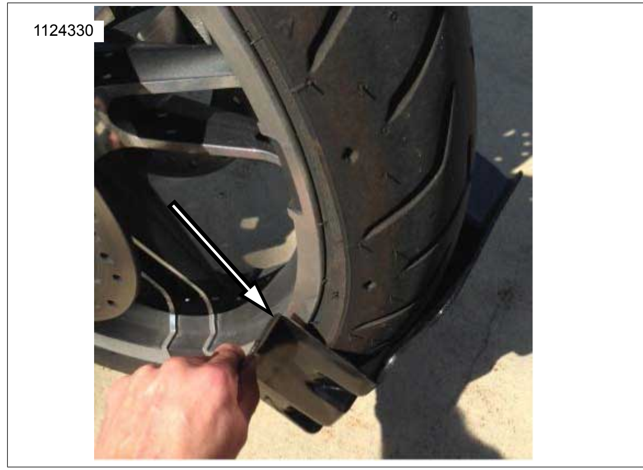
Figure 2. Removing Front Wheel Skid Spacer