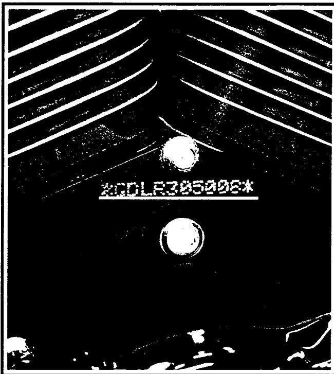
Figure 1. 1994 1340 cc Engines Engine VIN Stamping

See Figure 1. The abbreviated engine VIN is now being stamped horizontally, centered ABOVE the timing hole on the left side engine half of all 1340 cc engines.