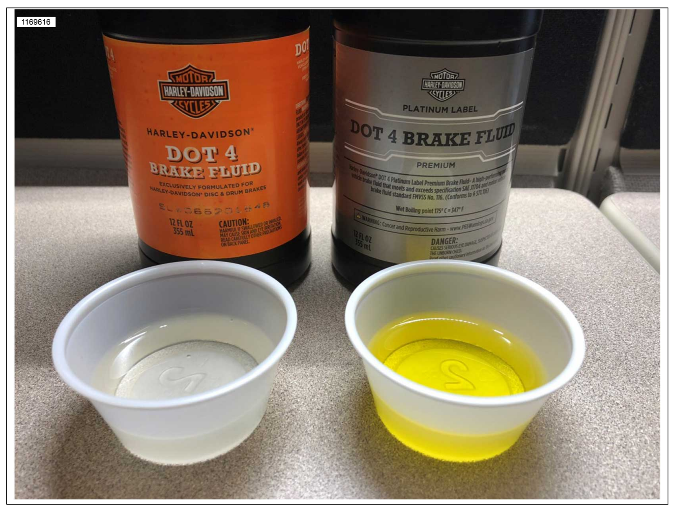
Figure 3. Dot 4 Brake Fluids

Refer to Figure 3. The difference in Platinum Label DOT 4 Brake Fluid chemistry will result in a noticeable color difference between the two fluids. The current DOT 4 BRAKE FLUID (41800219) is clear in color. The new fluid has a yellow tint to the fluid. Some may describe it as a yellow/green tint as well. These fluids are completely compatible and topping off one with the other, or slight mixing during the flushing process is not a problem.