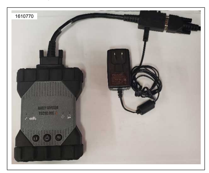
Figure 1. External Power Adapter

· Have a battery tender connected to the battery while performing software update.