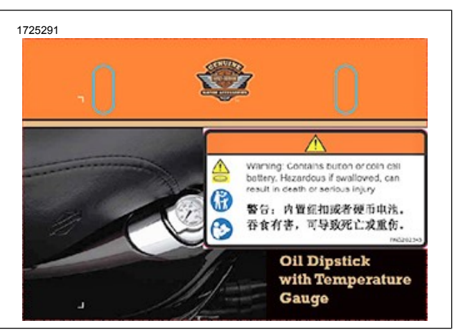
Figure 6. Box With Package Warning Label 14003753