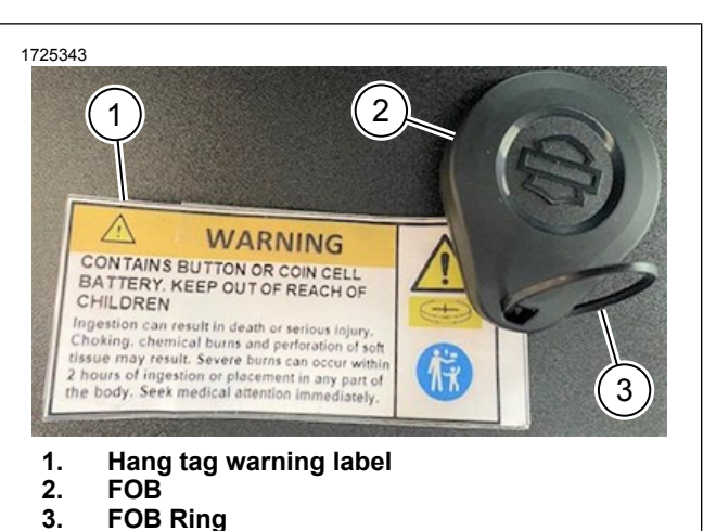
Figure 5. FOB With Hang Tag