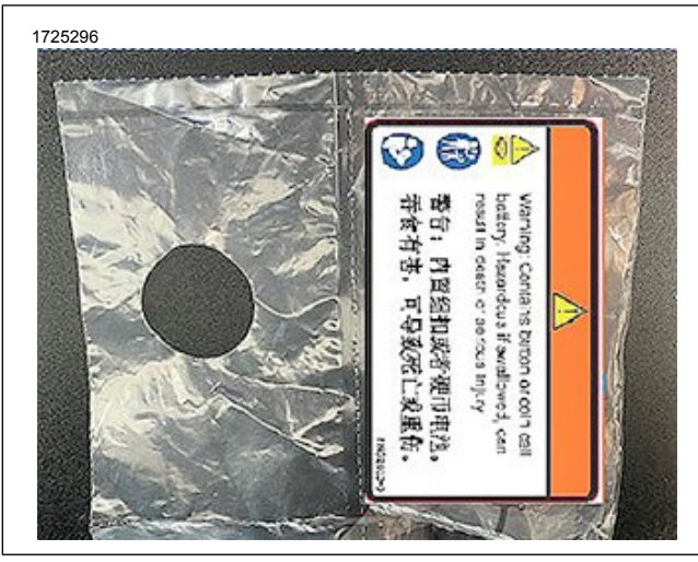
Figure 4. FOB With Package Warning Label