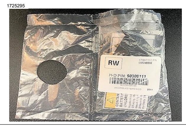
Figure 3. FOB With Hang Tag Warning Label