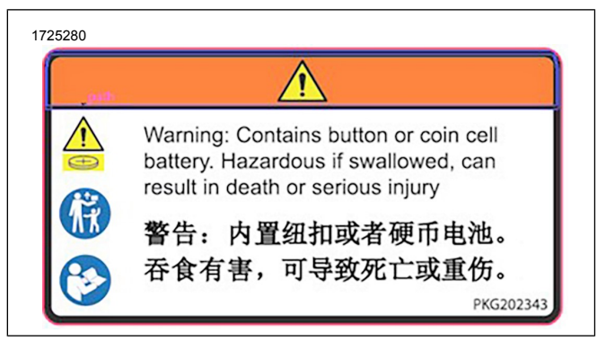
Figure 1. Package Warning Label 14003753