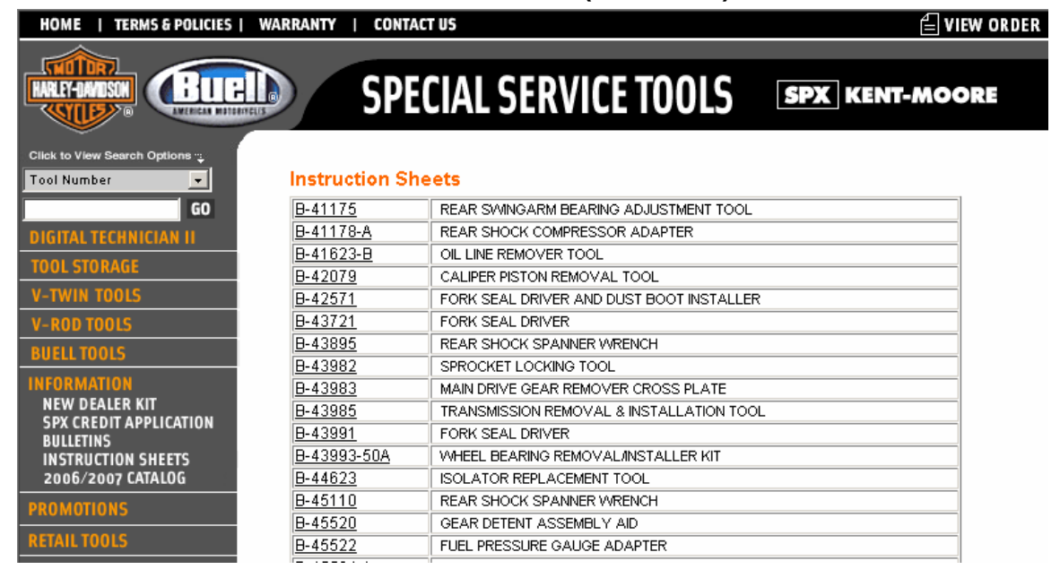
Screen shot of SPX Tool Site