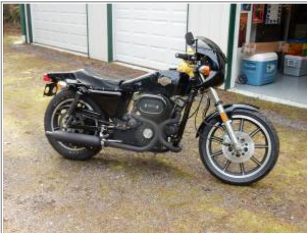
1978 XLCR 1000 - Last year in production - click to enlarge. (Original California model with one state only mufflers.) 17)