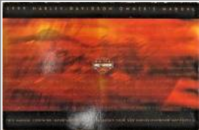
1999 Owners Manual (99466-99)