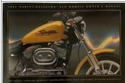
2001 XLH Owners Manual (99468-01)