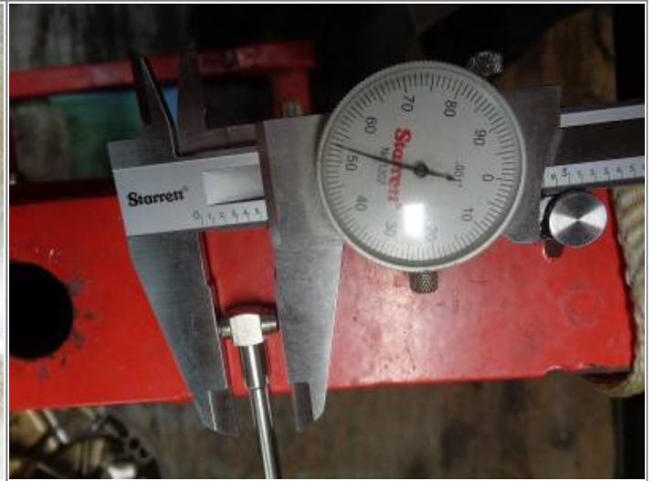
App. diameter of machined outer face 3)