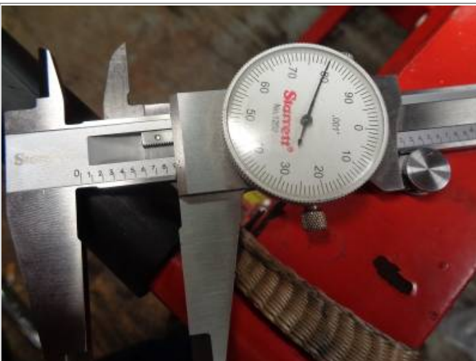
Measured from the case outside surface to the app. end of the case threads (app. 1/4" longer than the plug threads). 7)