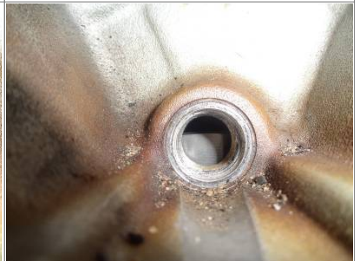
Measured from the case outside surface to the flywheel. 6)