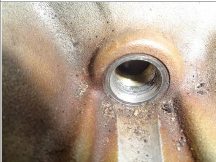
Flywheel sits close to the back of the hole 5)