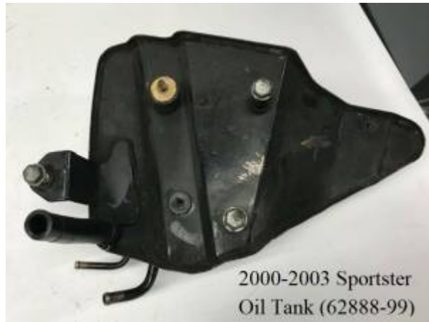
2000-2003 Sportster Oil Tank (62888-99)