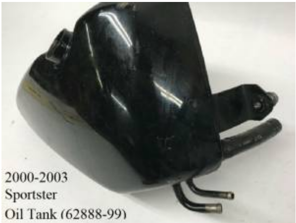
2000-2003 Sportster Oil Tank (62888-99)