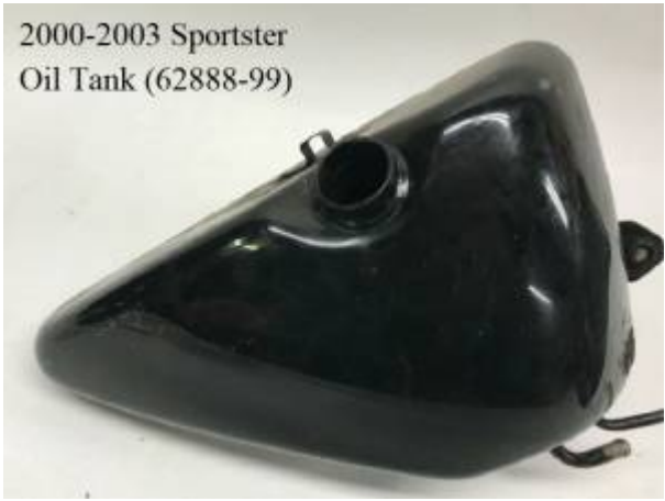
2000-2003 Sportster Oil Tank (62888-99)