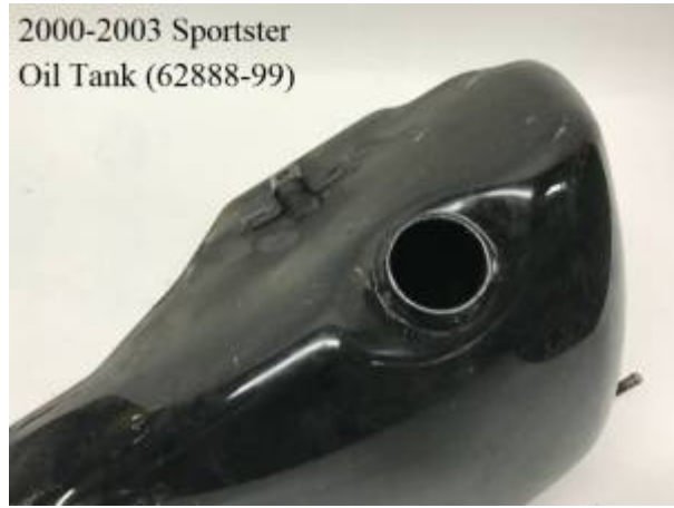
2000-2003 Sportster Oil Tank (62888-99)