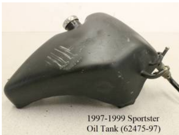
1997-1999 Sportster Oil Tank (62475-97) 9)