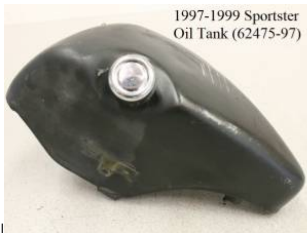
1997-1999 Sportster Oil Tank (62475-97) 10)