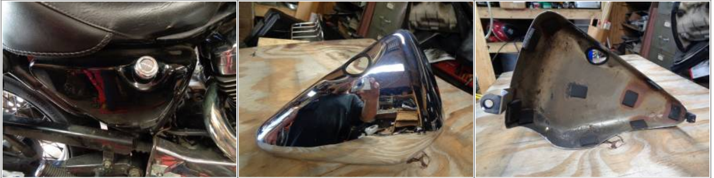
1997-1999 Oil Tank and cover (62475-97). (All models) 8)

It still has the threaded hole on the upper rear wall for use with earlier models.