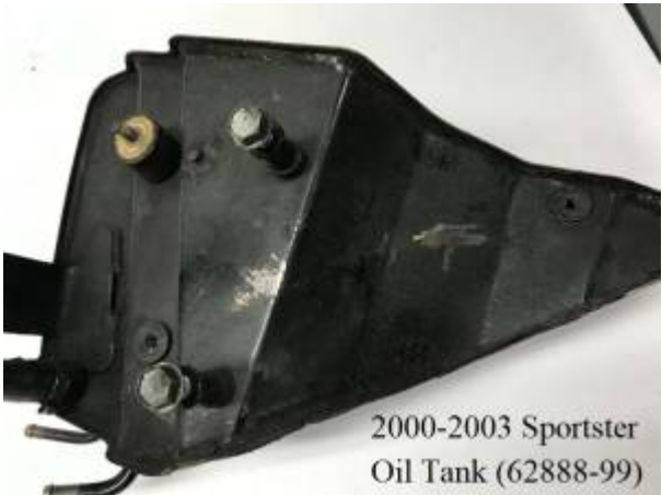
2000-2003 Sportster Oil Tank (62888-99)