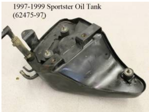
1997-1999 Sportster Oil Tank (62475-97) 11)