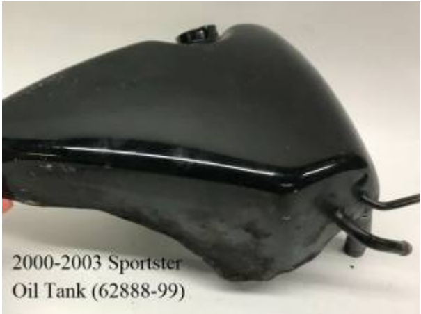
2000-2003 Sportster Oil Tank (62888-99)