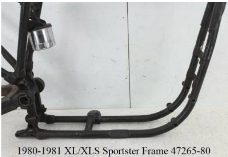
1980-1981 XL/XLS Sportster Frame 47265-80