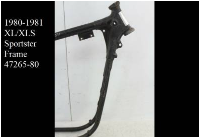
1980-1981 XL/XLS Sportster Frame 47265-80