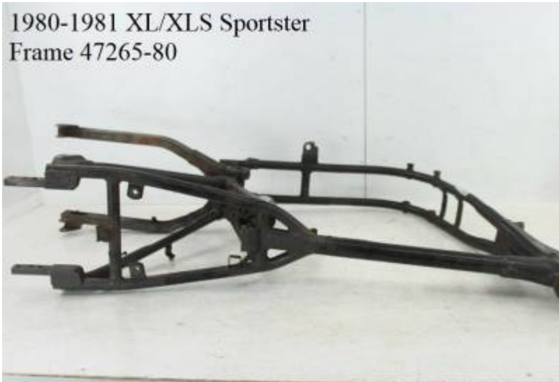
1980-1981 XL/XLS Sportster Frame 47265-80