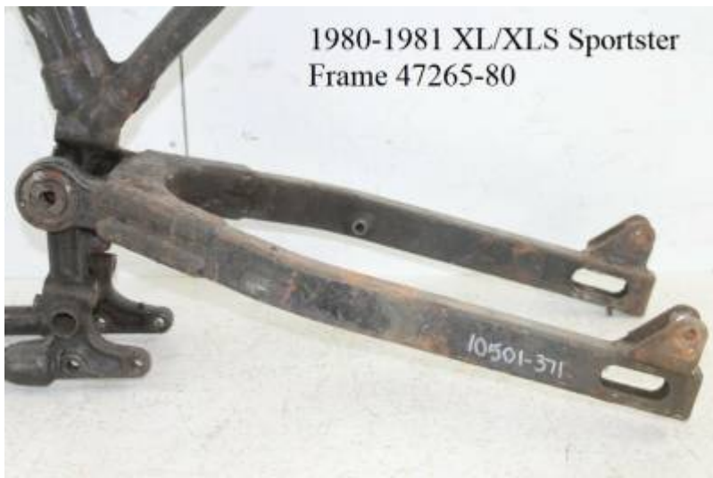
1980-1981 XL/XLS Sportster Frame 47265-80