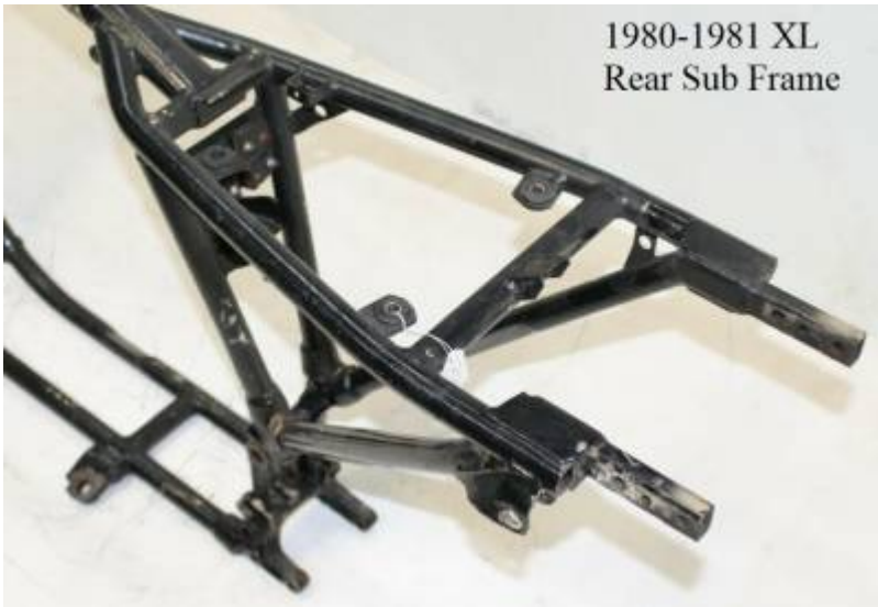
1980-1981 XL Rear Sub Frame