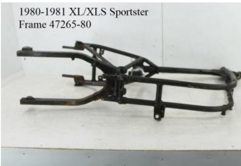
1980-1981 XL/XLS Sportster Frame 47265-80