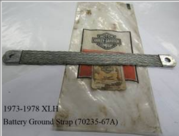
1973-1978 XLH Battery Ground Strap (70235-67A)