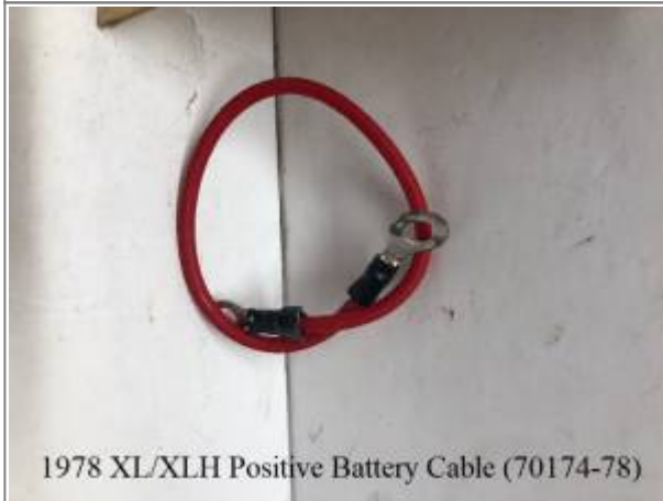
1978 XL/XLH Positive Battery Cable (70174-78)