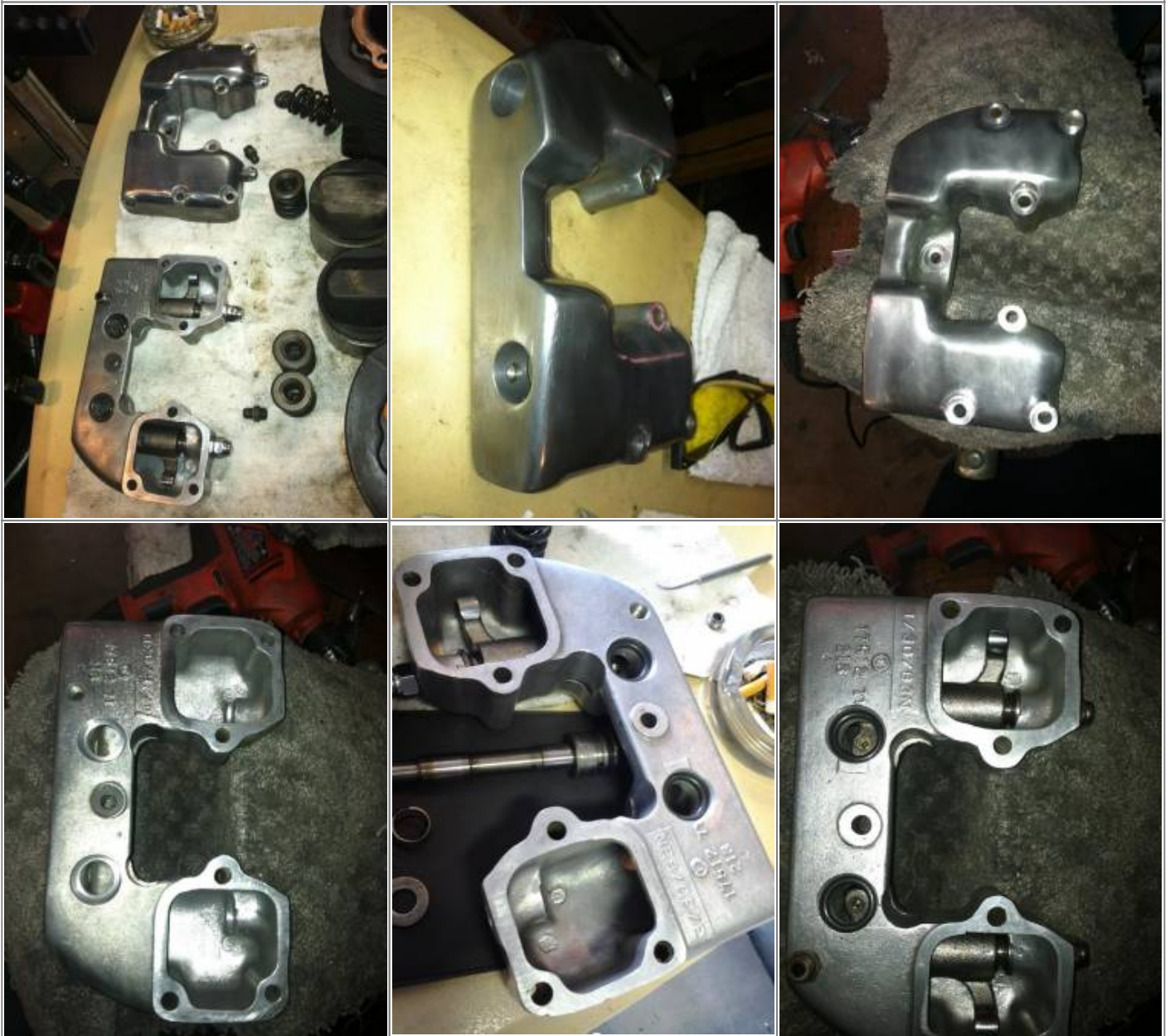
71-85 rocker boxes (F: 17514-71 and R: 17515-71). 12)