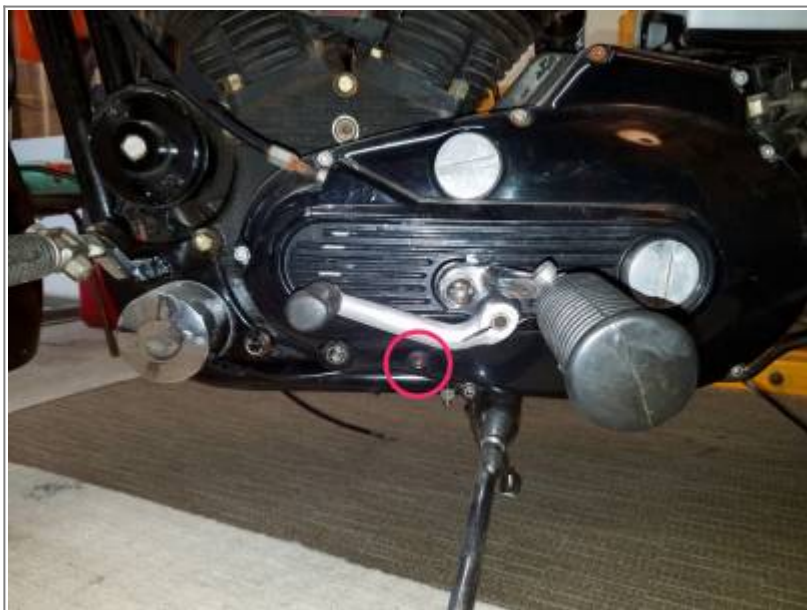
1982 Primary Oil Site Plug 2)

If the threads are jacked up when this bolt is removed, you can drill / tap to next size up. 1)