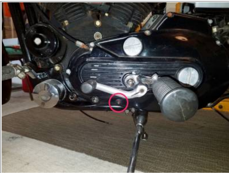
1982 Primary Oil Site Plug 2)

If the threads are jacked up when this bolt is removed, you can drill / tap to next size up. 1)