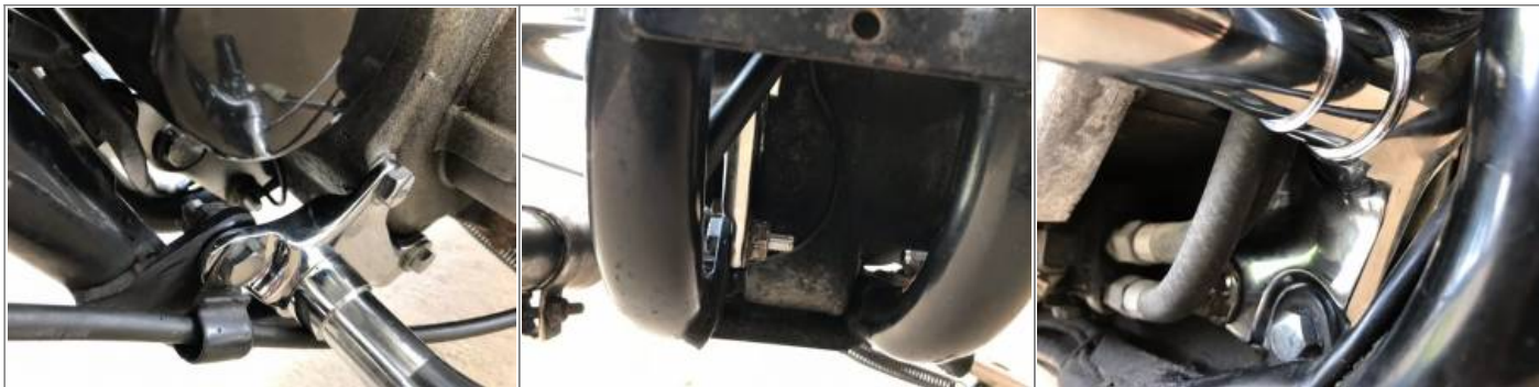
Right side. 4)