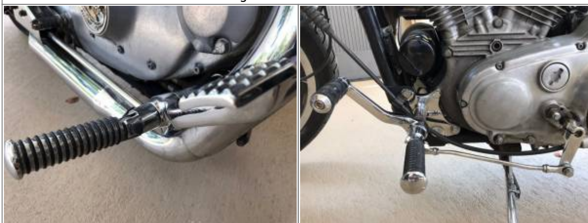
Pegs mount as usual. 5)

The shifter pedal arm slides onto the main support shaft. You can use axle grease and install it if needed. Use blue Loctite to secure the shifter foot peg to the shifter arm and align to your liking. Adjust the shifter peg with the shift rod that goes back to the shifter arm on the case. Unscrew it at equal distances to get the desired adjustment. Then use the lock / jam nut to secure. It's not necessary to use blue Loctite on the hem-joint to the shifter arm since a jam/lock nut is provided.