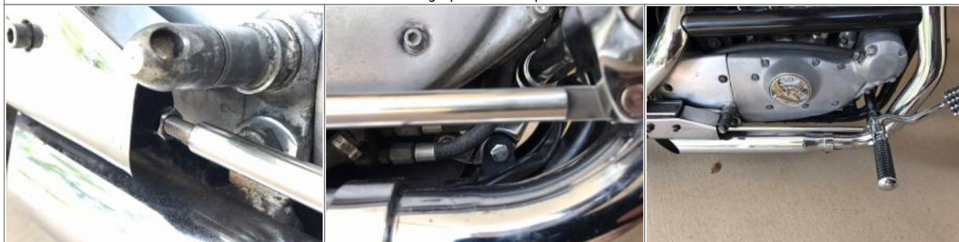
Hooking up the brake pedal. 7)

Note: Make sure to test the brake pedal action over low rpms and readjust the length if needed.