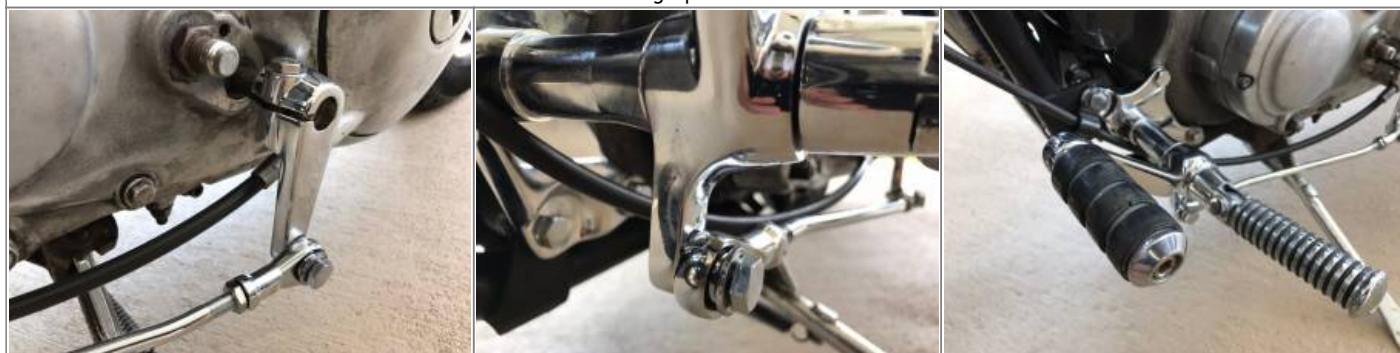
Hooking up the shifter. 6)

The brake pedal arm slides onto the main support shaft. You can use axle grease and install it if needed.