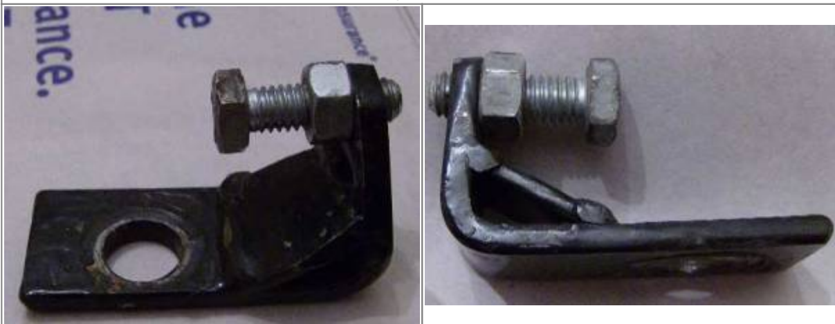
Rear Brake Stop for mid-controls. 10)

A better idea might be to use a later model rear brake master cylinder. It has a different design which holds the brake rod in with a snap ring (circlip). It also is easier to repair as it uses a one-piece kit. There have been lots of these on eBay in the past.