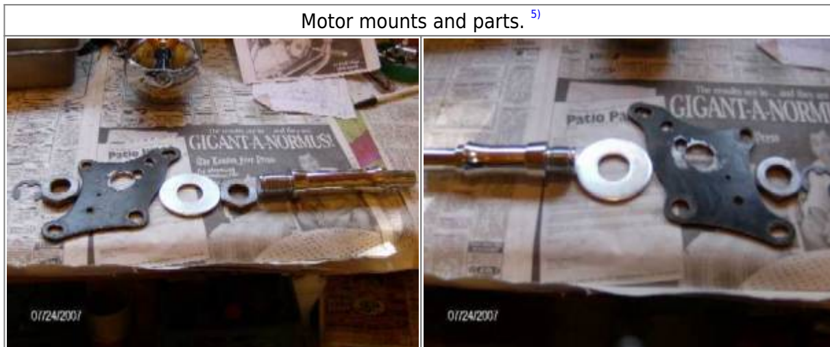
Motor mounts and parts. 5)

Template for lower front motor mount hole to be drilled: