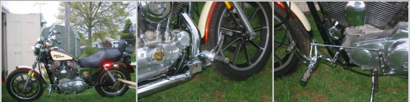
Performance Machine forwards for XLC mounted to a 90 XLH 1200 9)