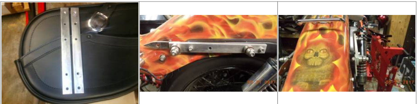
Aluminum flat bar (1"x3/8"x10-7/16") to move the holes backwards w/ Easy Mount bushing bolts tapped into the bar. Turns relocated. 9)

Just about any bag can be mounted on any bike. It depends on a lot of variables you need to figure out before attempting a custom mount. Factors including looks (high/ low position as well as the dimension between the fender and the bag). Some people do not mind a gap between the bag and the fender and some will not like it at all. Other factors to consider are passenger leg room, rear turns position, ground clearance and, of course, the main reason for installing bags is to carry more stuff with you than what you can fit in your pocket. Below are some pics of custom mounts for saddlebags. Click on a pic to enlarge.