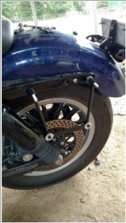
Viking saddlebag mounts 8)