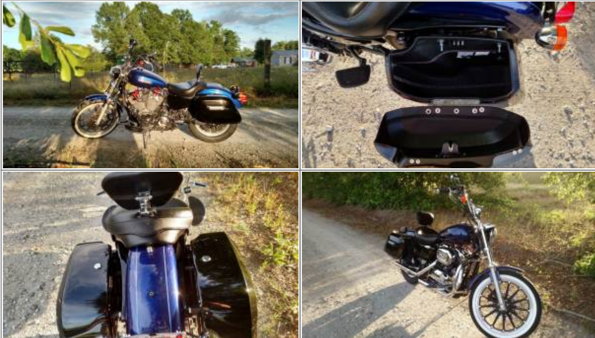
Viking Lamellar bags mounted on a 06 1200. Dims: 8" x 22.5" x 13.5" 7)