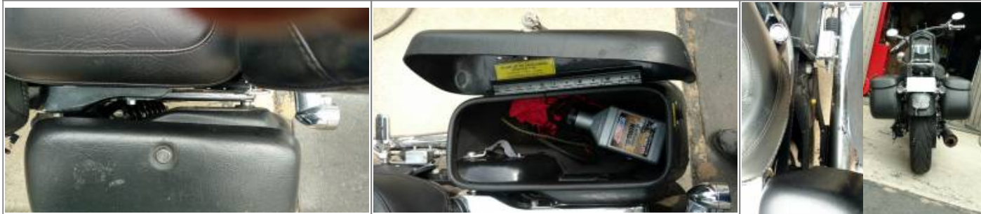
Leatherlyke Cruiser hard bags on a 2002 1250C. Dims: 7.5" Wide x 11.5" Tall x 18" Long. Hardware is quick release for easy bag removal. Keyed locking lid, closed cell neoprene liners, weather proofing seals, and necessary mounting hardware included. 3) 4)