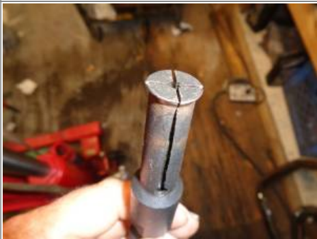
Decrease the width of the collet 2)