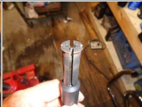
Install it into and behind the bushing 3)