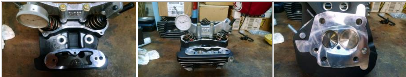
Standard Screaming Eagle Pro CNC Heads 2)