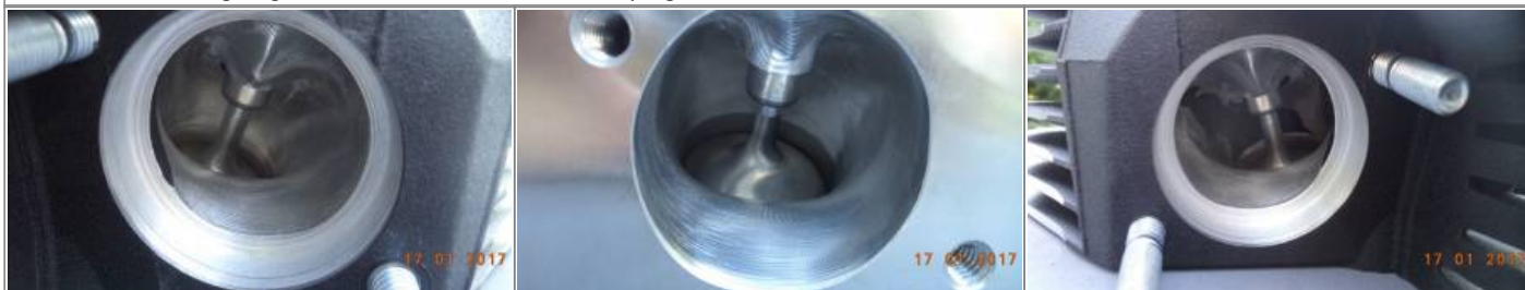
SE Pro heads (cookie cutter machining in ports) 4)