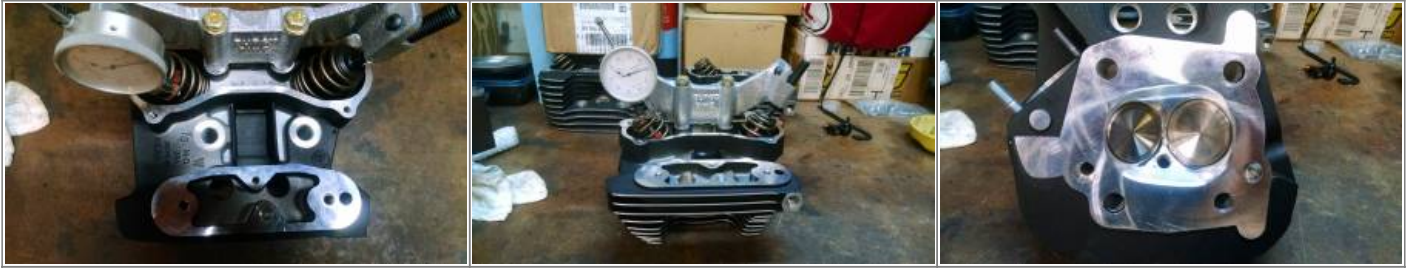
Standard Screaming Eagle Pro CNC Heads 2)