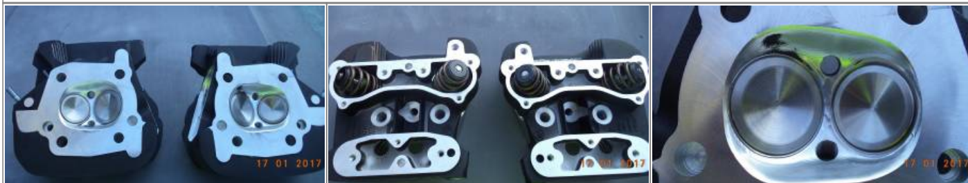
Standard Screaming Eagle Pro heads machined for 2nd plug for S models 3)