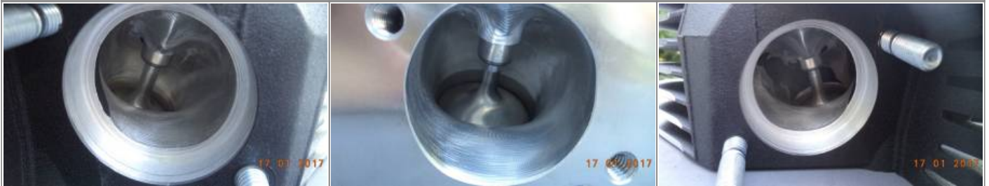
SE Pro heads (cookie cutter machining in ports) 4)