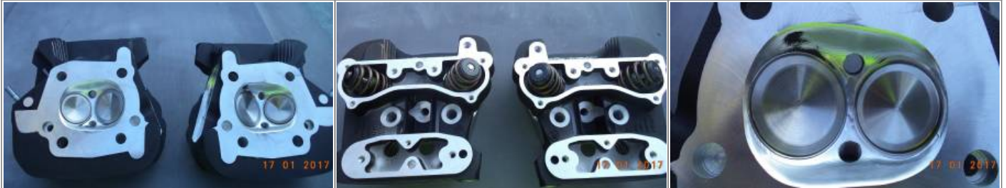
Standard Screaming Eagle Pro heads machined for 2nd plug for S models 3)