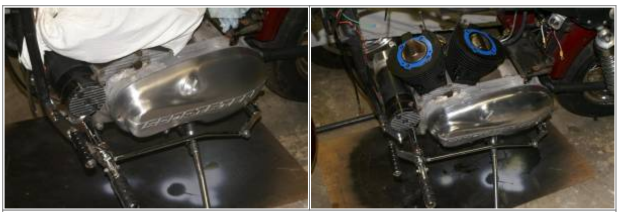
Primary cover polished w/ Scotchbrite and dishwater, then with aluminum polish 31)

This is an aluminum Evo derby cover, not chrome, but shined up nice.