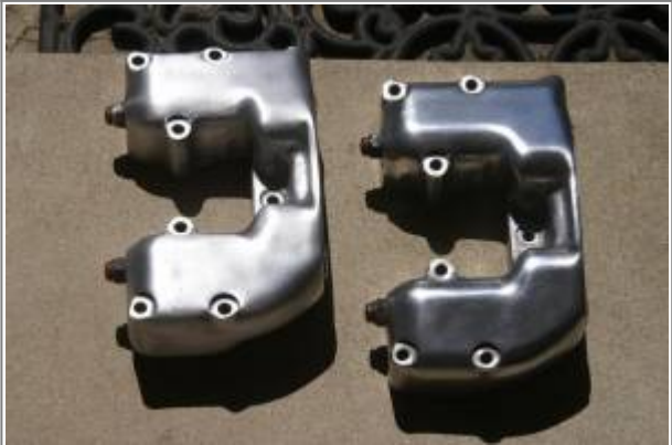
Ultra fine Scotchbrite on one side, followed by aluminum polish on the other: 30)

http://sportsterpedia.com/ Printed on 2024/01/23 02:58