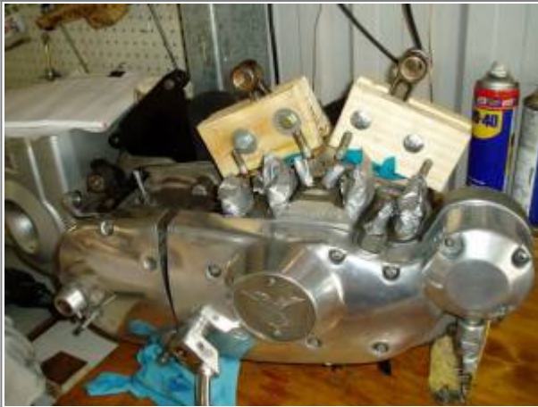
A couple bits of timber and four bolts. Holds them nice an steady for reaming. 9)