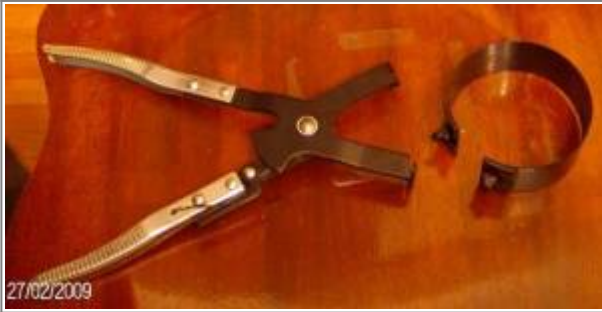
Ring Pliers 1)

A wooden spacer with slot to hold piston steady as you slide the cylinders on. Also, a Volkswagen “krinkle cut” ring compressor that comes apart after the cylinder is on. The crinkle cuts stop it from jamming up in between the piston and cylinder. Also, use plenty of oil in the rings, piston and cylinder to help it all slide on. 2)