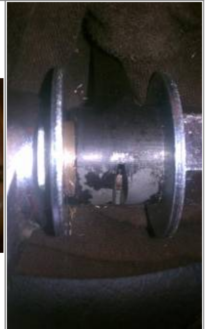
Wrist pin bushing installer: 3/4" bolt with two washers and a nut. 7)