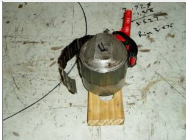
Cylinder Installing Jig 3)