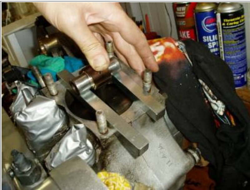
Check to see if the pin is parallel to the crankcase mouth by using two pieces of 3/4" precision key steel from your local bearing supply shop. 11)