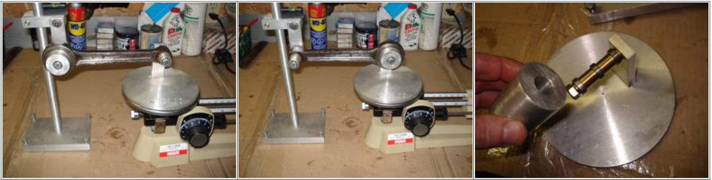
Jig for Balancing Rods 12)