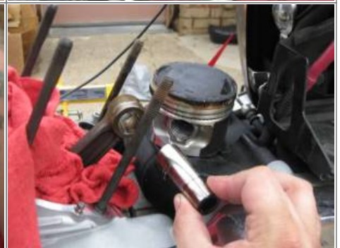
A 1/2x13 carriage bolt set into the pin hole and either pushed or light threading motion with pressure applied to remove the wrist pin. 8)