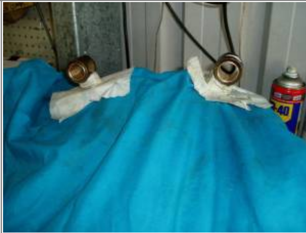
Two holes in a rag with some tape stops any bronze chips from getting down in the crankcase. 10)