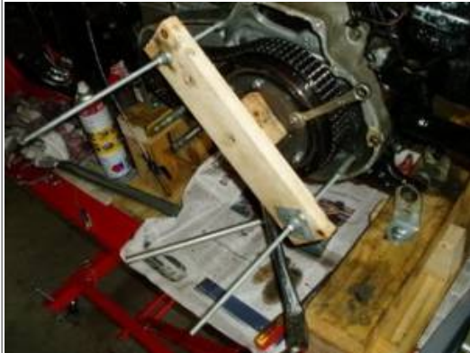
Clutch spring compressor 4)