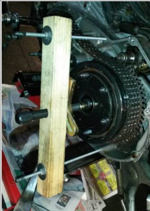
Clutch spring compressor 5)