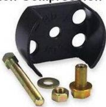
Barnett 317-30-30001 Clutch Compression Tool