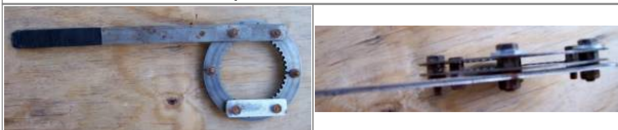
Clutch Hub Tool 2)

Two pieces of timber screwed together, some 1/4" UNC threaded rod, 1/4" nuts and washers. It does not have the center screw like the factory tool. Just tighten down the nuts on the threaded rod to compress the clutch springs. 3)