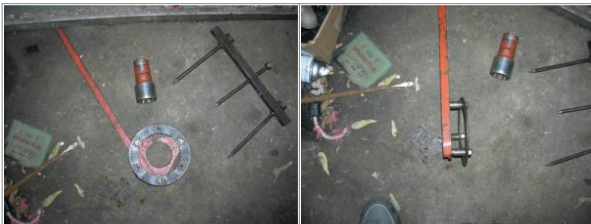
4 Speed Clutch Hub Tools 1)