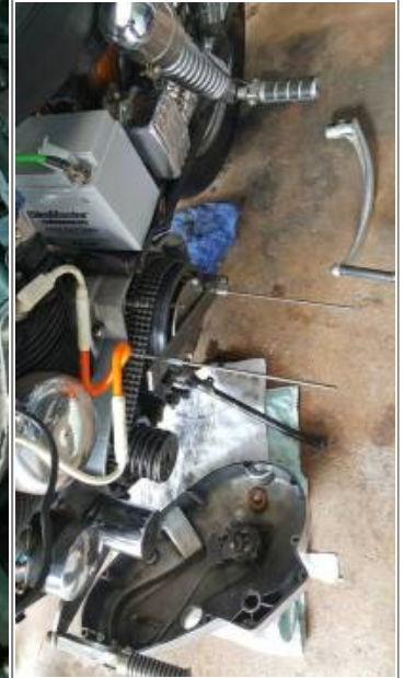
Clutch spring compressor 6)