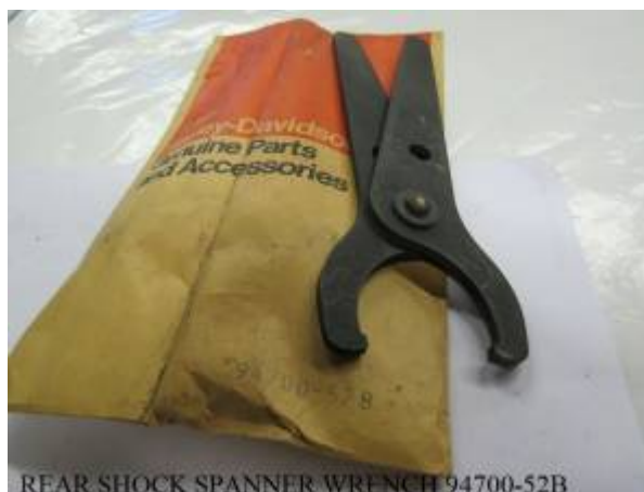
REAR SHOCK SPANNER WRENCH 94700-52B

These C-clamp pliers make a good tool to adjust the spring cam height if you don't have the proper spanner. The ends were ground to an angle using an angle grinder. Then you simply adjust the jaws to fit opposite holes in the cam with very light clamp pressure on the tool and turn the spring cam where you want it.