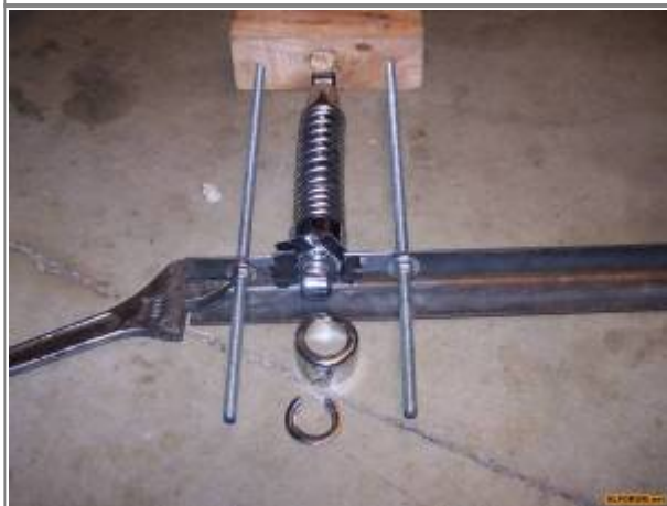
Homemade spring compressor 13)