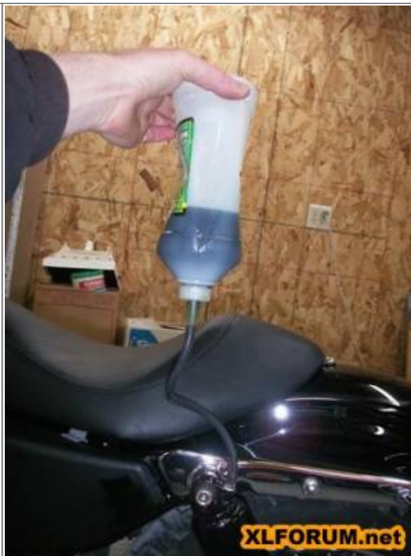
Installing RK shock oil 12)