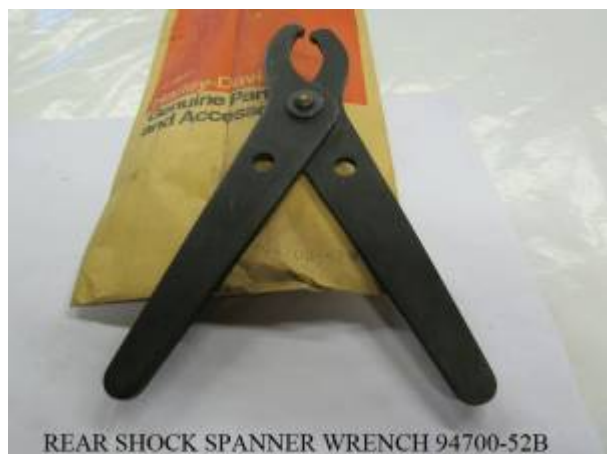
REAR SHOCK SPANNER WRENCH 94700-52B

Used to adjust rear shocks for more or less spring compression. Fits all 1966-earlier rear sprung K, KH, FL and 1967-1974 Sportsters.