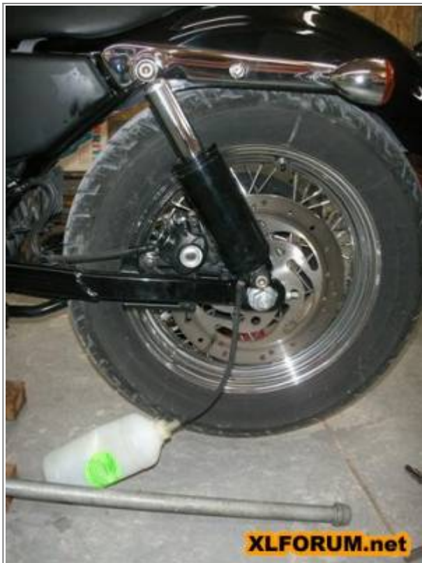
Removing RK shock oil 11)