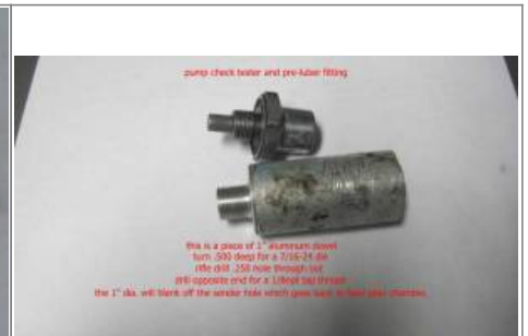
Oil pump check valve tester / pump prelube tool. 6)