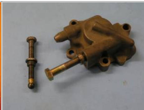
Check-ball seat burnishing set 5)