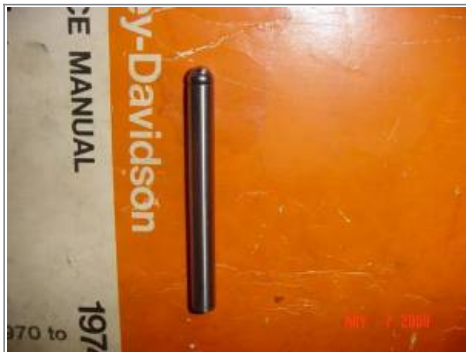
Homemade check ball lapping tool 4)

The tool on the right was made as a check ball tester and oil pump prelube tool. With this tool, all you have to do is use a grease gun (without grease) filled with oil and pump it into the system so a dry start can be avoided. 3)