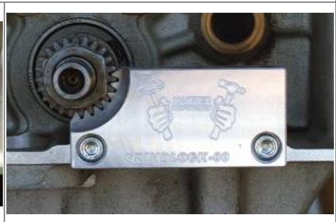
Grindlock 91-99 & Grindlock 2000

(designed by XLFORUM member, "~Grind~" and Built by Hammer Performance 9) 10) 11) 12)