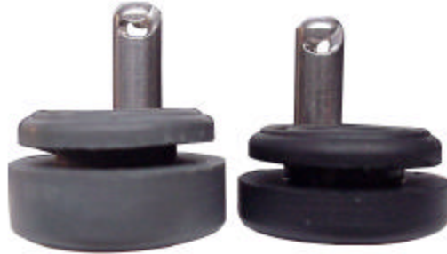
Figure 3: FLHTCSE parts are on the left. Standard production is shown on the right.

Another saddlebag location difference can be seen on all 2000 and later CVO Touring models. The saddlebag grommets on this custom vehicle are gray and thicker to provide additional inboard saddlebag clearance for accessories. This thicker grommet, part number 11468, also requires a longer bail head stud, part number 90400-00. Do not mix either of them with the black grommets and shorter pins used on standard production models. See Figure 3.