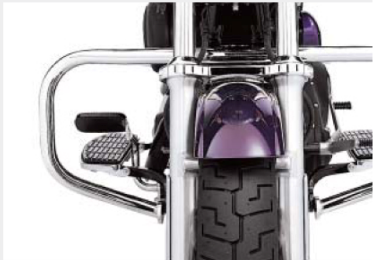
A. CHROME ENGINE GUARD KITS

XR750 Engine Kit – This kit requires the purchase of the following two part numbers: 16070-98R, engine and transmission components 24512-88R, crankcase Please update page 94 of the Screamin' Eagle Pro Racing Catalog.