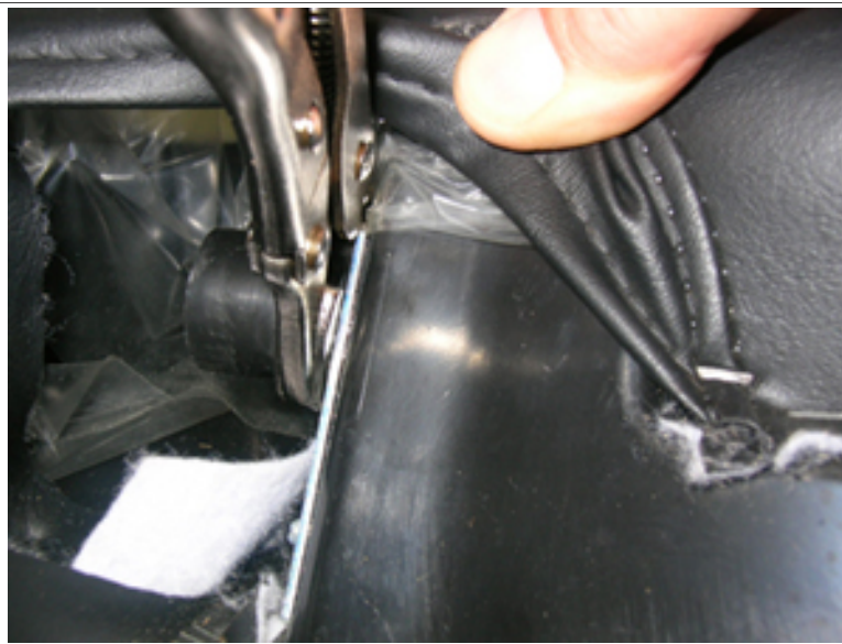
Figure 2. Isolator Rubber Attached to Threaded Base