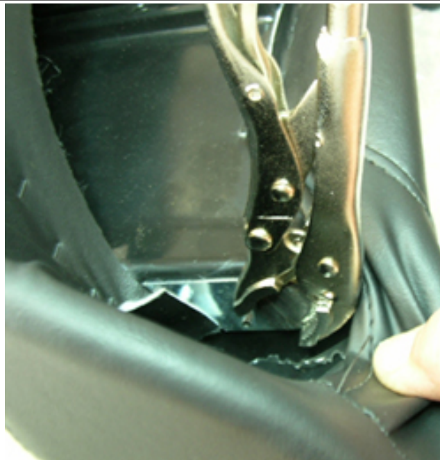
Figure 3. Threaded Isolator Tab Prepared for Removal